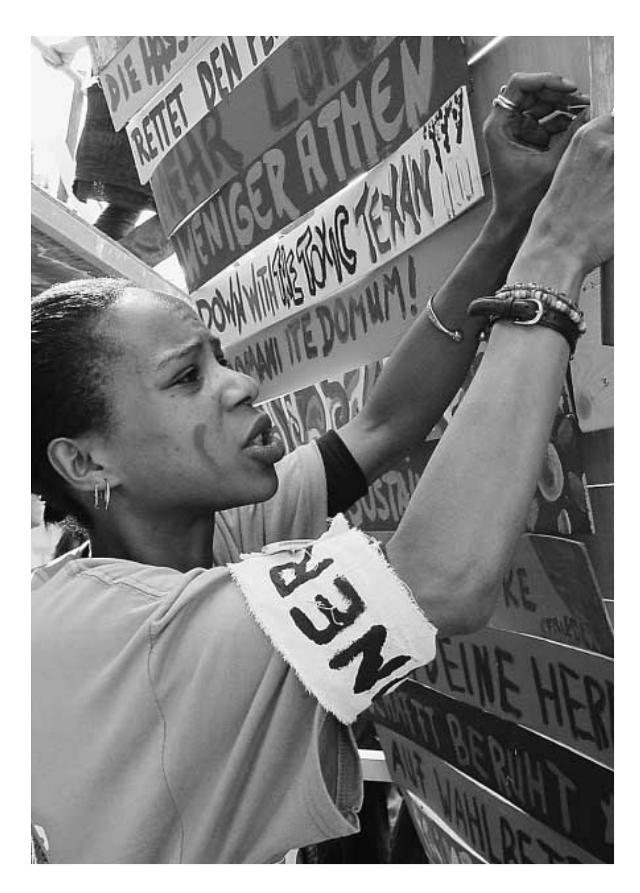
The Lifeboat: Friends of the Earth action on climate change (Bonn 2001)