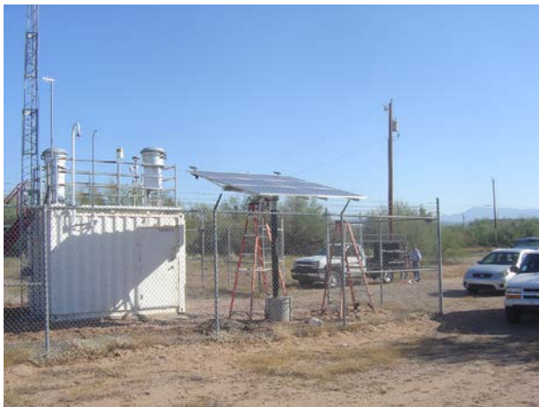
Photo: Air quality monitoring station with 1.5 kW solar installation

In addition to the demonstration project on HQ2, the tribe also operates a small, 1.5 kW solar tracking system on the air quality monitoring station (see photo below). The six 250-watt panels track solar radiation throughout the day and currently produce about 50% of the monitoring station's energy.