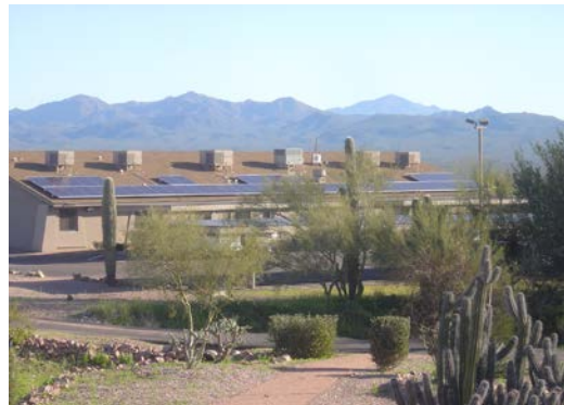
Photos: Tribal headquarters building 2 (HQ2) – Before the solar installation (left), and after the solar installation (right)