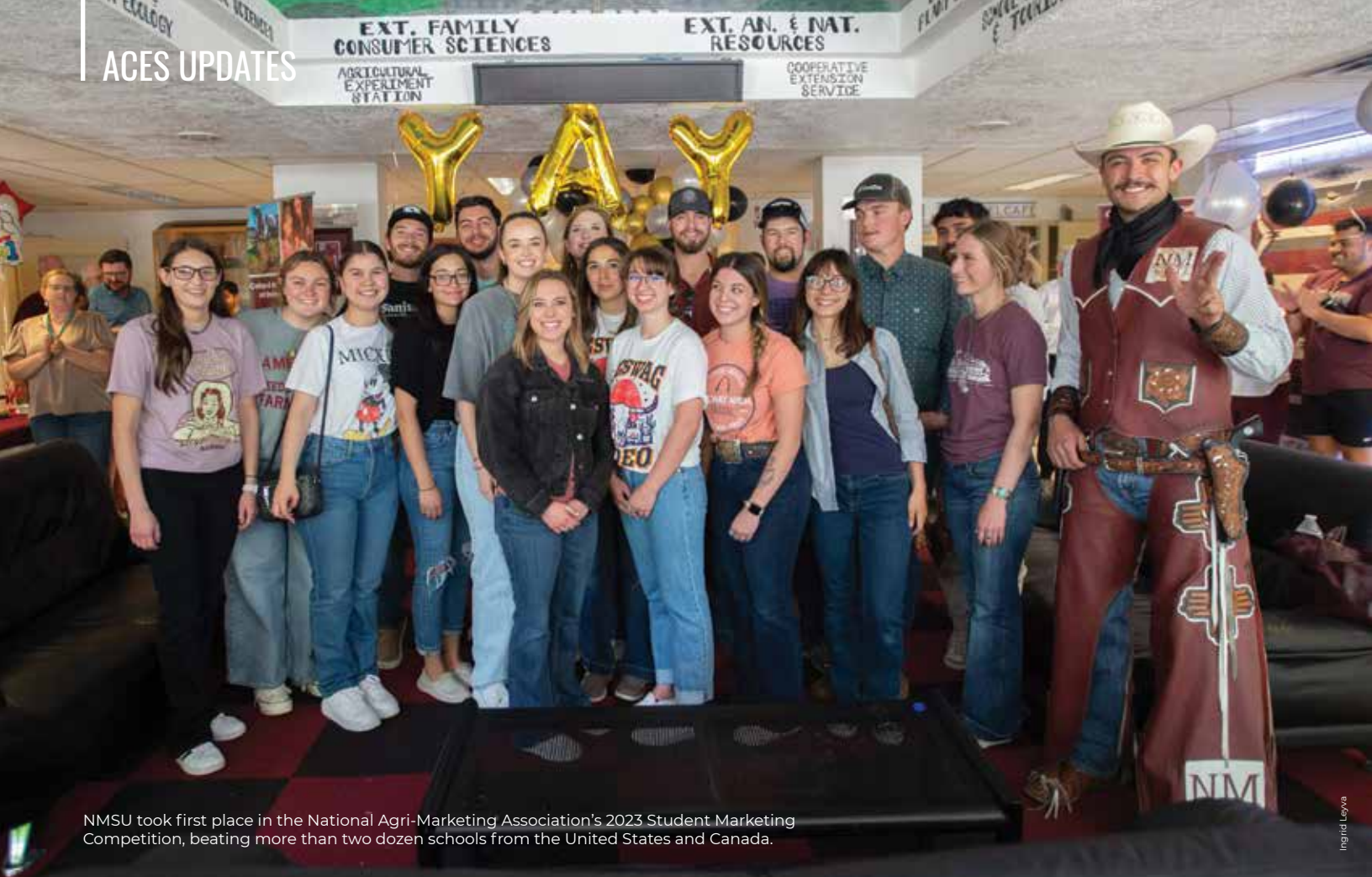
NMSU took first place in the National Agri-Marketing Association's 2023 Student Marketing Competition, beating more than two dozen schools from the United States and Canada.