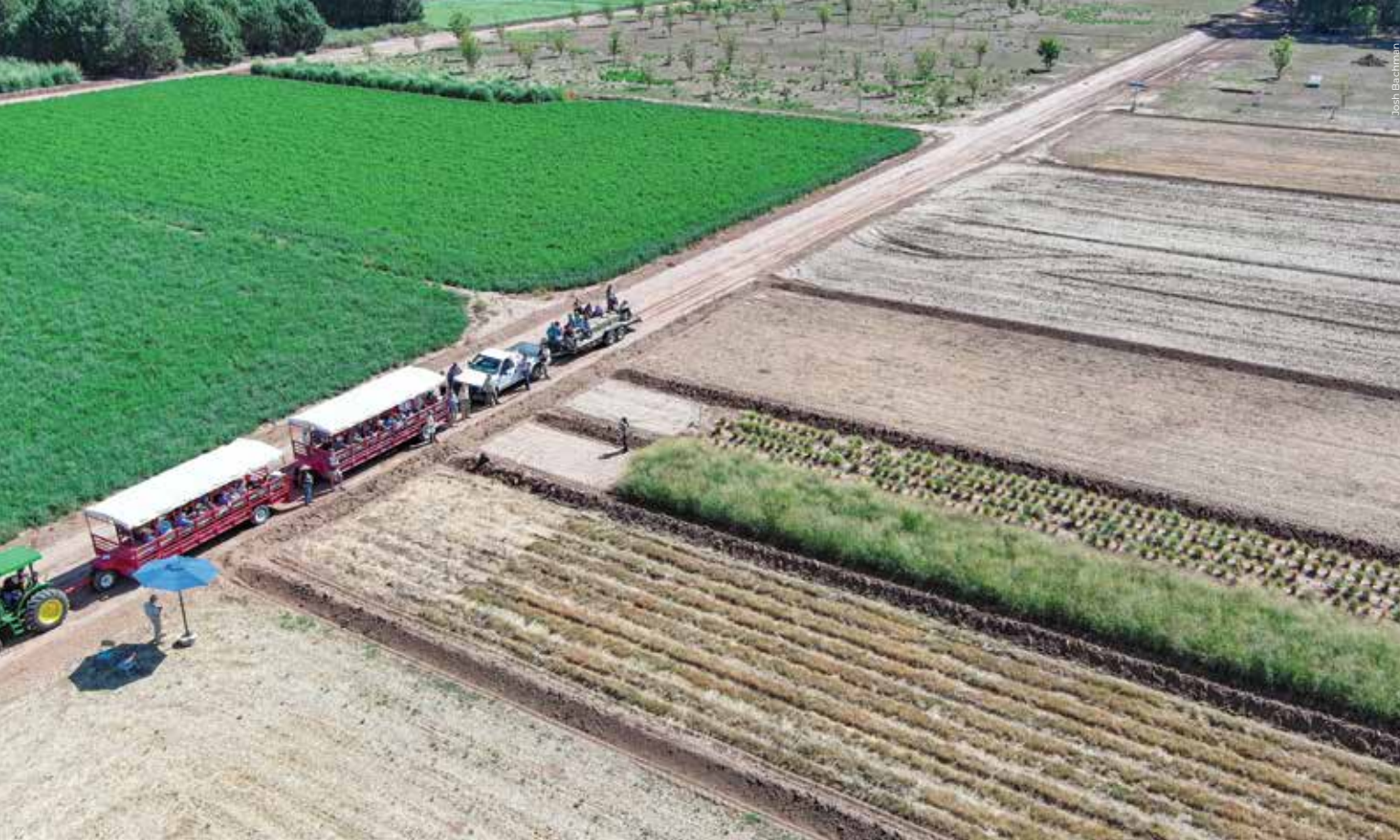
NMSU's Agricultural Science Center at Los Lunas has several ongoing projects investigating grass varieties, including how various types of perennial grasses contribute to the sustainability of natural resources and local economies in New Mexico.

N MSU's Agricultural Science Center at Los Lunas is home to a number of research projects. But one has garnered great interest and highlights a decades-long collaboration between the center and the United States Department of Agriculture's Natural Resources Conservation Service.