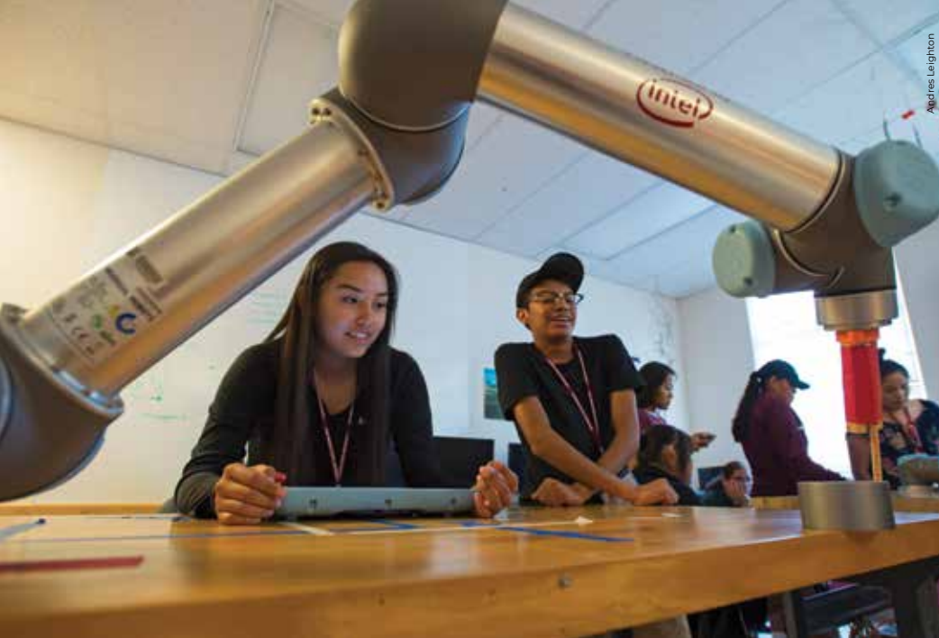
Native American high school students participate in the 2018 Dream Keepers summer program organized by Indian Resources Development. IRD, a statewide program housed at NMSU, offers educational and professional development opportunities for Native American students in high school and college. It also supports tribal nations in New Mexico in advancing their economic development goals.

Internship opportunities offer students a chance to explore a possible career, learn innovative skills, experience different places and meet new people on their academic journey. For some Native American high school and college students in New Mexico, the experience can be life-changing.