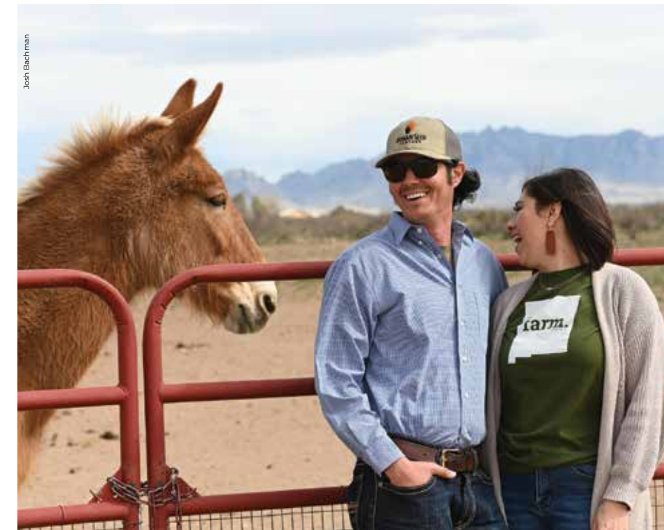
Here to Help New Mexico launched in 2022 as a collaboration between NMSU’s Southwest Border Food Protection and Emergency Preparedness Center, NMSU’s Cooperative Extension Service, the New Mexico Department of Agriculture and the New Mexico Farm and Livestock Bureau.

To learn more about Here to Help New Mexico, visit heretohelpnm.com .