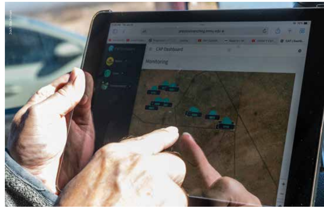
Utsumi's research team designed a prototype cow neck collar that can track a cow's movements with triaxial accelerometers, GPS antennas and temperature sensors through an associated app. The collar also helps collect data on preferred grazing areas, the number of visits to drinking water locations, walking distances, resting behavior, changing climates, forages and rainfall.

"We believe that our new digital ranching technologies can improve the sustainability of ranching and beef systems in New Mexico and the Southwest," Utsumi said. "The ability to virtually fence livestock and monitor health, drinking water, forages and rainfall in real time could improve ranch planning significantly through faster adaptation to changing climates, lower ranch-monitoring costs, and animal wellness – all while likely reducing the carbon footprint of ranching."