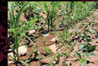
A new wave of grain Page 31