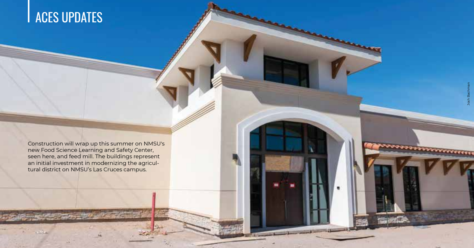
Construction will wrap up this summer on NMSU's new Food Science Learning and Safety Center, seen here, and feed mill. The buildings represent an initial investment in modernizing the agricultural district on NMSU's Las Cruces campus.