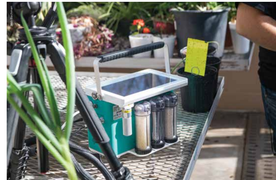
Gomez wrapped up the two-year research project this spring. His preliminary findings show that the ‘He Shi Ko’ bunching onions, commonly known as scallions, had the highest assimilation compared to bulbing onions and other types of bunching onions. His research will help inform future studies examining the effects of water stress on vegetables and greenhouse experiments.

“Ultimately,” he said, “I want to combine community involvement, scientific research and traditional knowledge to increase food and agricultural sovereignty in marginalized communities like my pueblo.”