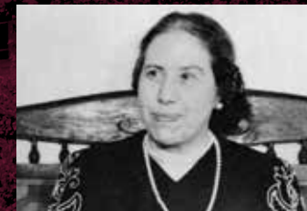
Treasured teacher Page 20