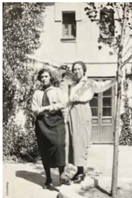
Left: Cabeza de Baca, right, stands with an unidentified woman. Center: Cabeza de Baca published Historic Cookery , the earliest cookbook about New Mexican food, during the early 1930s. Right: Cabeza de Baca published two more books later in life and wrote extensively for newspapers.