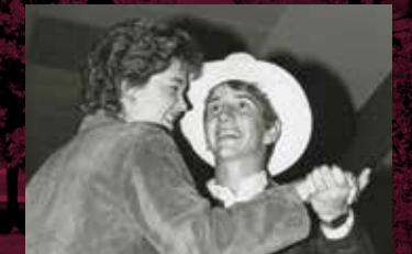
4-H forever Page 34