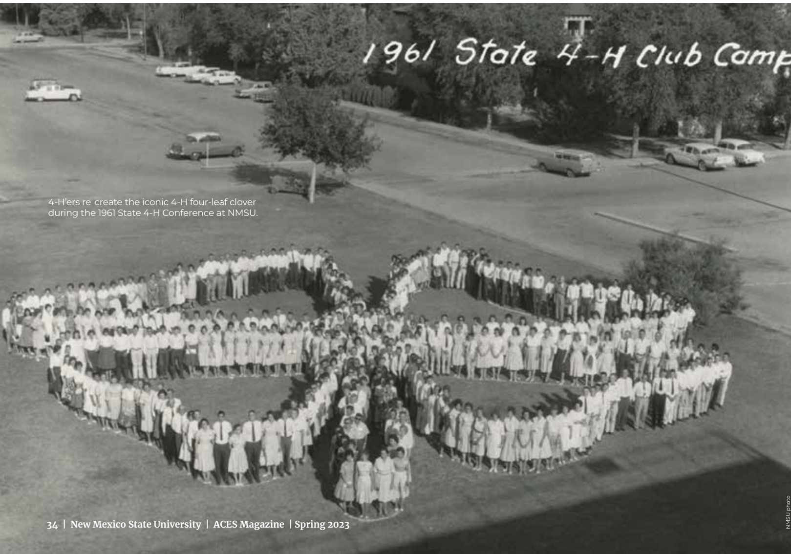
4-H'ers re-create the iconic 4-H four-leaf clover during the 1961 State 4-H Conference at NMSU.