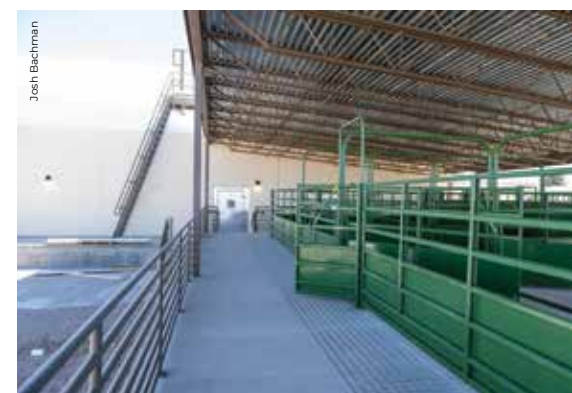
The feed mill, above, and the Food Science Learning and Safety Center, right, are part of the first phase of a project funded by general obligation bonds approved by New Mexico voters in 2018 and 2020. Another facility, a biomedical research building, is wrapping up the first of three phases.