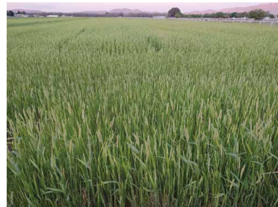
In partnership with the Southwest Grain Collaborative, NMSU's agricultural researchers are producing new research in cropping systems and soil management to support better yield and production for crops like Sonoran white wheat, blue corn and heirloom bean varieties.

In partnership with Southwest Grain Collaborative, NMSU's agricultural researchers are producing new research in cropping systems and soil management to