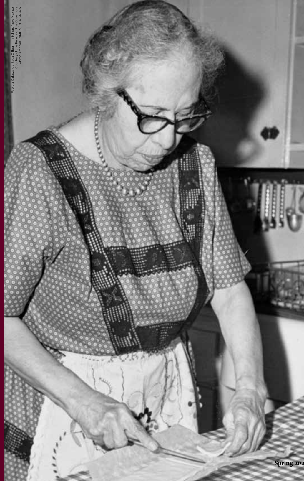
Fabiola Cabeza de Baca Gilbert in Kitchen, New Mexico. Courtesy of the Palace of the Governors Photo Archives (NNHMDC), 148467

In an undated black-and-white photograph, Fabiola Cabeza de Baca stands poised in a kitchen, looking down over a table draped in gingham cloth. She wears a patterned dress, an embroidered apron, a pearl necklace, and a pair of cat-eye glasses. Her hair is pulled back, her lips are pursed, and her gaze is fixed. She holds a knife in one hand and appears deep in concentration, working gracefully with the food before her.