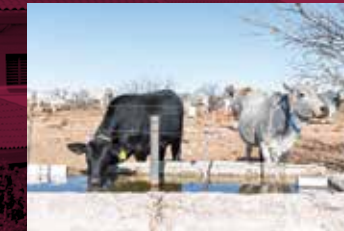
A future without fences? Page 14