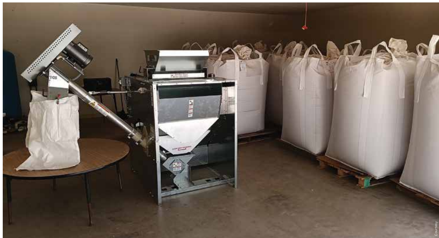
A clipper grain cleaner with totes of Sonoran white wheat milled on a farm that works with the Southwest Grain Collaborative. SGC is working with NMSU's Semi-arid Cropping Systems Research Innovation Program to help local grain producers capitalize on demand for locally sourced foods and build a robust farm-to-table pipeline in New Mexico and the Southwest.