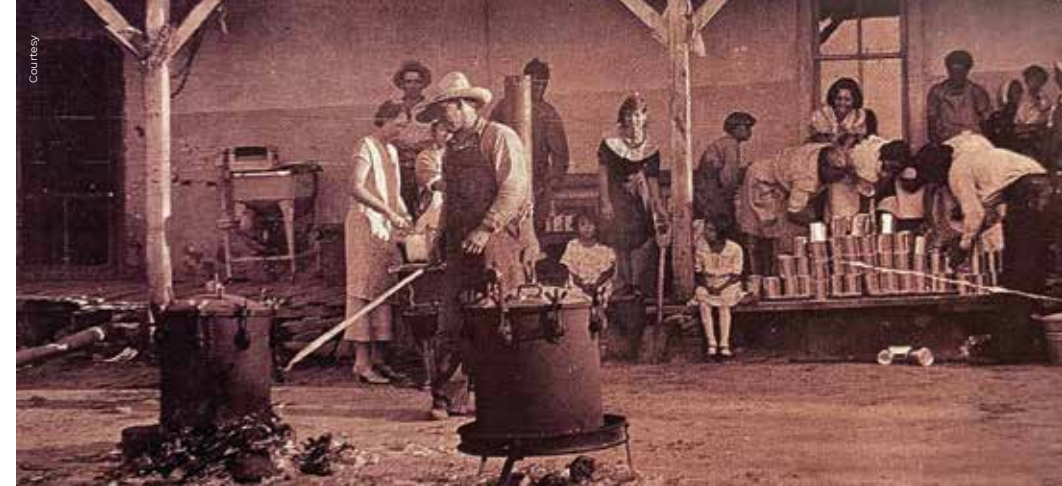
Cabeza de Baca taught rural women gardening, food preservation, poultry-raising, sewing and home repair. Her ethnicity allowed her to respectfully blend traditional ways with new information.

someone who also strives to reach minoritized and underserved audiences, I felt an immediate connection to her story. She taught rural women gardening, food preservation, poultry-raising, sewing and home repair. Her ethnicity allowed her to respectfully blend traditional ways with new information.