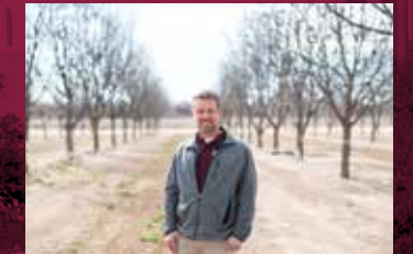
Rooted in research Page 18