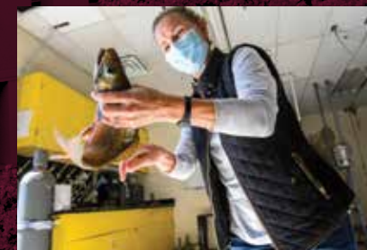
Forces of nature Page 20