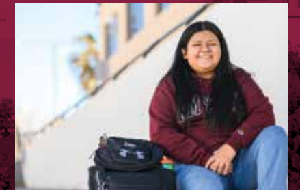
Home away from home Page 16