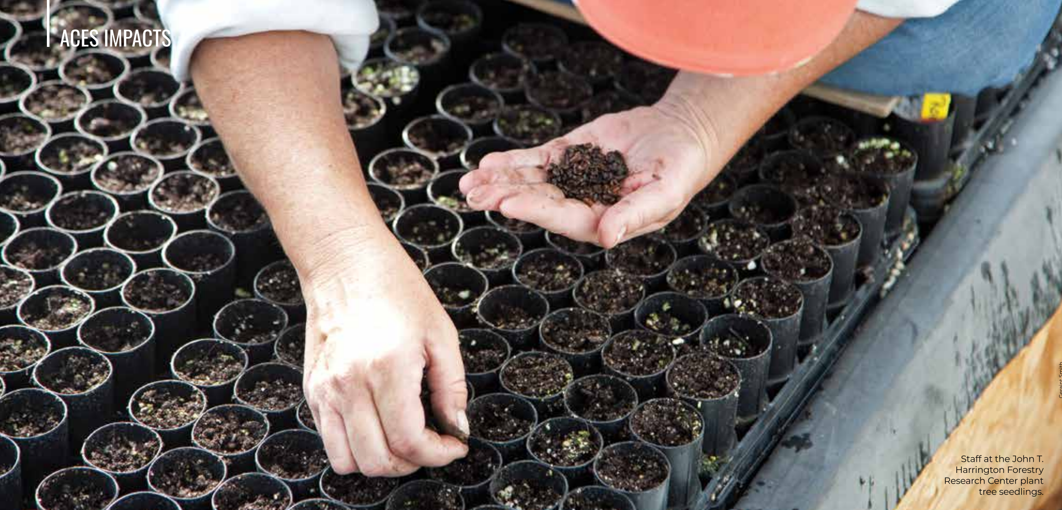
Staff at the John T. Harrington Forestry Research Center plant tree seedlings.