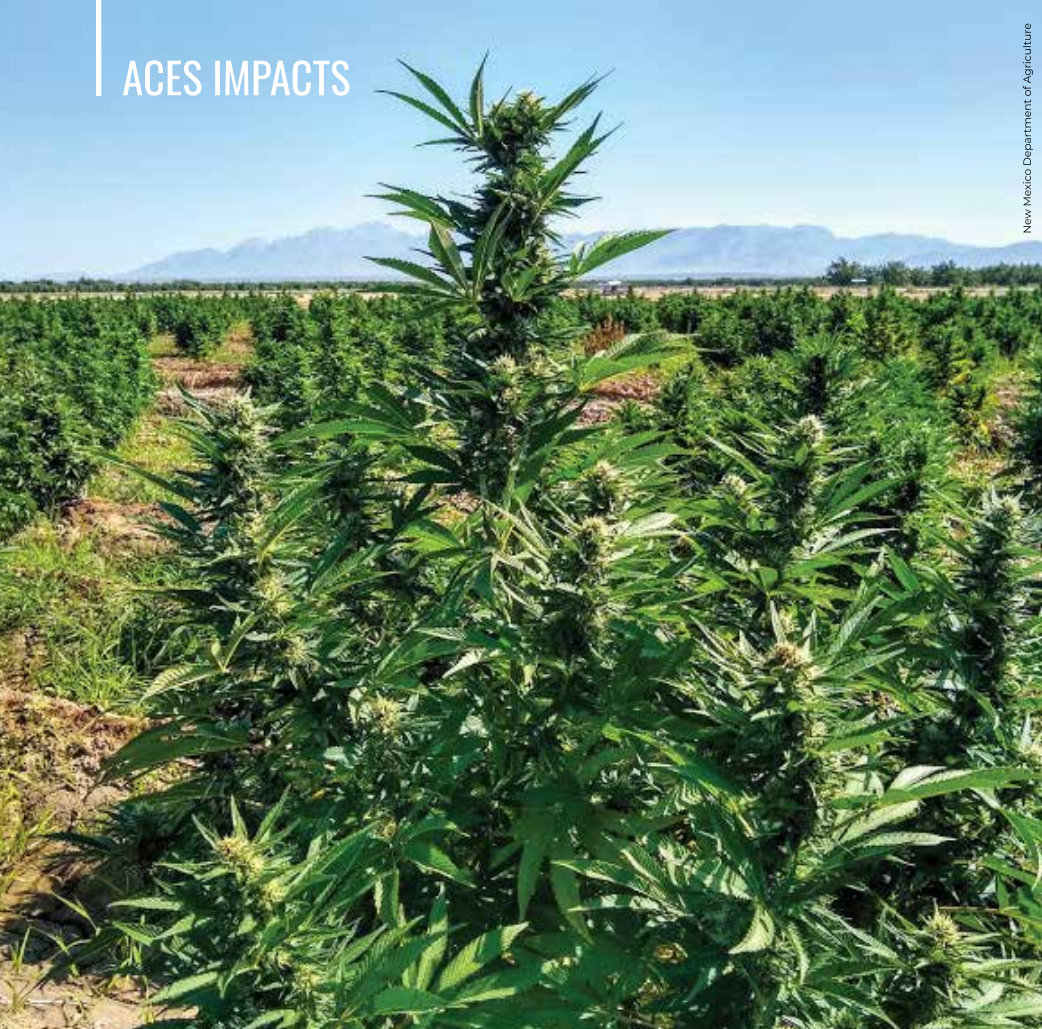
New Mexico Department of Agriculture

granted NMSU a permit to grow hemp. NMSU also obtained an exemption from the Navajo Nation Council for hemp research.