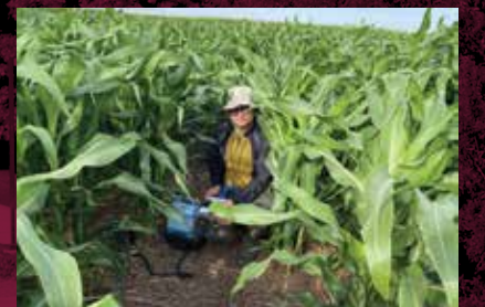
Capturing CO 2 Page 28