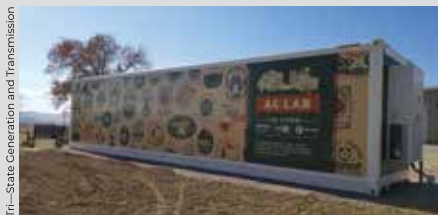
Tri-State Generation and Transmission

The NMSU Center of Excellence in Sustainable Food and Agricultural Systems has partnered with Tri-State Generation and Transmission to join the Electric Power Research Institute’s National Demonstration and Monitoring of Indoor Food Production Facilities research project to explore indoor agriculture concepts.