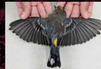
Avian alarm Page 26