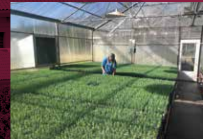
Reforestation America Page 12