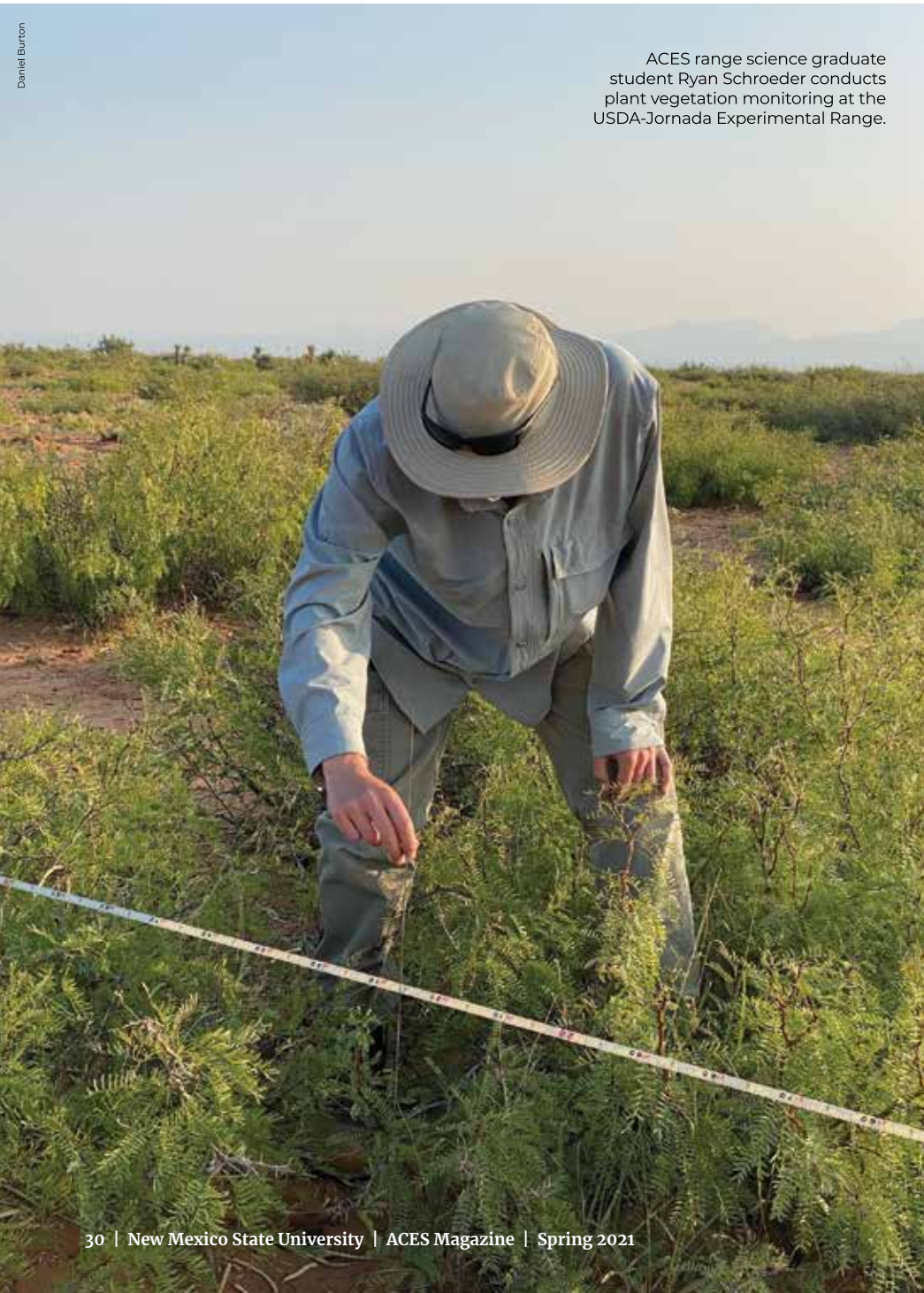
ACES range science graduate student Ryan Schroeder conducts plant vegetation monitoring at the USDA-Jornada Experimental Range.

in the atmosphere to vegetation and woody biomass and ultimately to the soil. The second part is minimizing loss of carbon already stored in vegetation or soil,” Ghimire said. “Both components are important to increase carbon storage for food production benefits and climate change mitigation.”