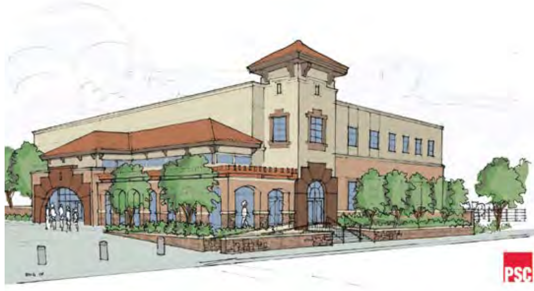
Renderings courtesy of Parkhill, Smith & Cooper

This project is important to New Mexico and NMSU because agriculture and food processing account for about $4 billion in sales annually in the state. This represents an important part of New Mexico's economy.