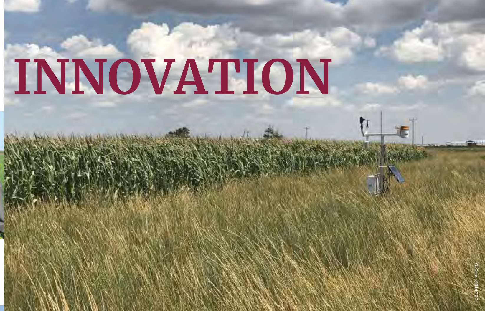
Perennial grasses thrive in a "buffer strip" established within an irrigated field in Eastern New Mexico. With center-pivot irrigation systems widely used in the area's farmlands, such buffer strips could provide protective microclimates to shield young plants from wind and conserve water.

Also at the Clovis Science Center, researcher Rajan Ghimire is looking at innovative ways to improve agricultur-