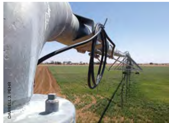
The arm of a center pivot irrigation system stretches from the center of a field toward the horizon. Dwindling water availability in recent years had caused many farmers to irrigate only two-thirds of their circular fields, with a third left fallow. To college researchers, those fallow areas seemed like an ideal opportunity for the "buffer strips" project.