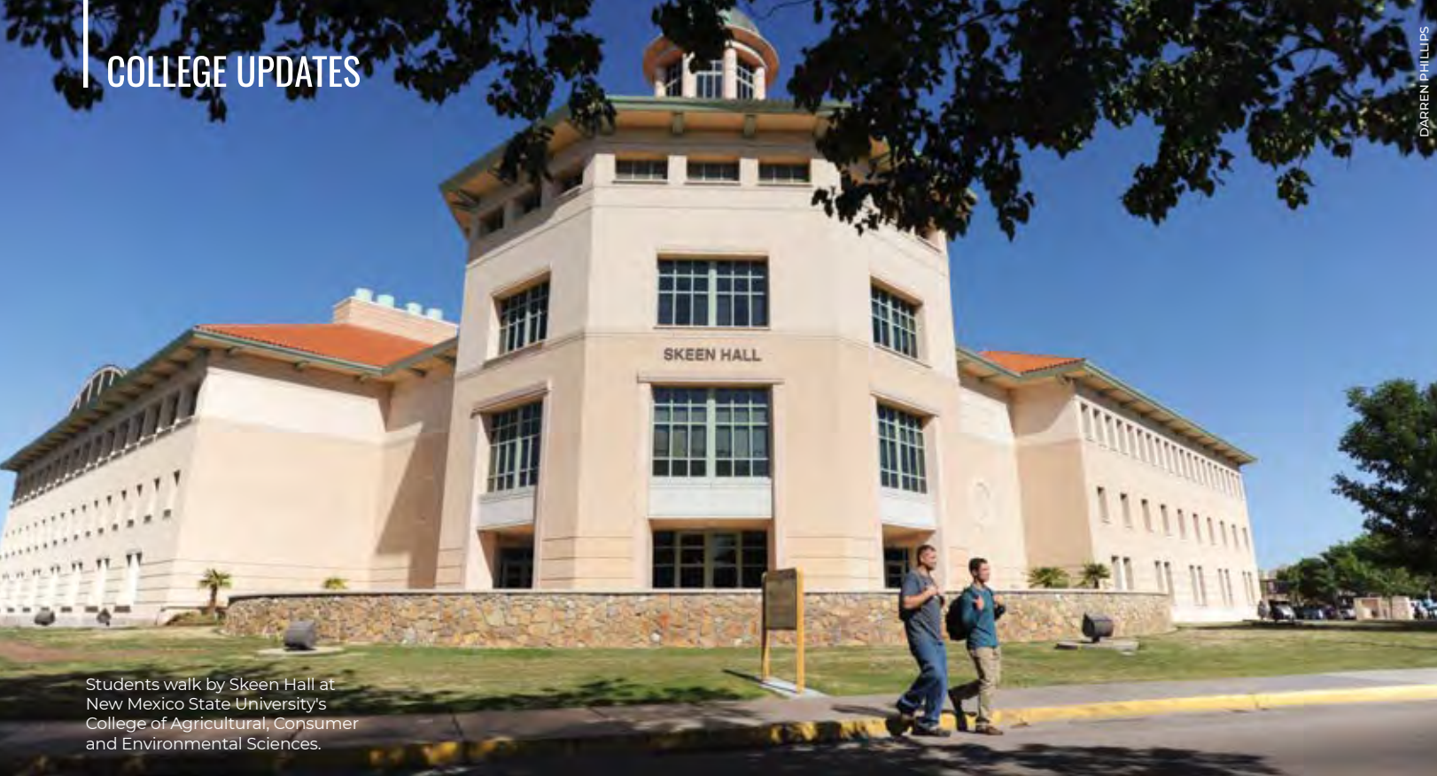
Students walk by Skeen Hall at New Mexico State University's College of Agricultural, Consumer and Environmental Sciences.