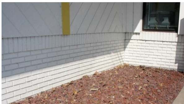
Figure 6. Crushed stone provides a superb weed-free barrier.

Habitat modification and sanitation reduces both the conditions attractive to mice and the ability of resident mice to survive. Mice cannot maintain large populations when the availability of living space and food are restricted. Reduce the attractiveness of structures by creating a three-foot wide weed-free barrier around the structure. Crushed stone (one-inch diameter) to a depth of three inches or more is best but even bare soil will do. Research shows that mice do not like to cross areas lacking cover (Fig. 6).