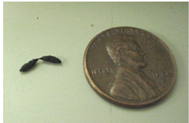
Figure 5. Mouse dropping.

Droppings provide conclusive evidence for the presence of rodents. Droppings average \frac{1}{8} to \frac{1}{4} inch in length with one or both ends narrowing to a point (Fig. 5). On rare occasions the droppings will appear round. The droppings are usually black in color, but will vary according to the mouse's diet. Droppings of deer and white-footed mice will look similar. In contrast, droppings made by bats typically will be found in piles and will sparkle when illuminated. The sparkles are caused by light reflecting off the exoskeletons of insects, the prey of all of Montana's bats. All droppings should be treated as infectious. (See additional information below under "Disease Safety").