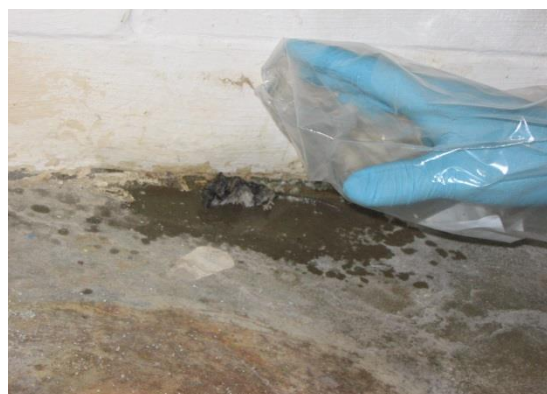
Figure 14. After spraying disinfectant on the mouse, pick it up with a gloved hand inside a plastic bag.

Turn the bag right side out so that the mouse is inside the bag. Seal the bag. Wrap the bagged mouse in newspaper or place it in a box and dispose of it with other household wastes. Spray the trap and area of the original set with disinfectant and let dry. Carefully remove your gloves by turning them inside out and dispose of them with other household waste. Wash your hands thoroughly. Be aware that some disinfectants may stain surfaces, carpets, and fabrics.