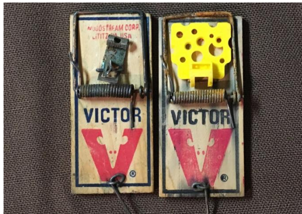
Figure 7. Traditional trigger (left) and expanded trigger (right) mouse traps.

Snap traps come in a variety of models and designs. All are effective in catching mice. Traps with expanded triggers, however, have a higher capture rate. (Fig. 7).