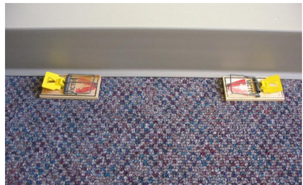
Figure 9. Traps set side-ways against a wall.

If you must place traps sideways against walls, then be sure the triggers of the traps face outward, as in Figure 9.