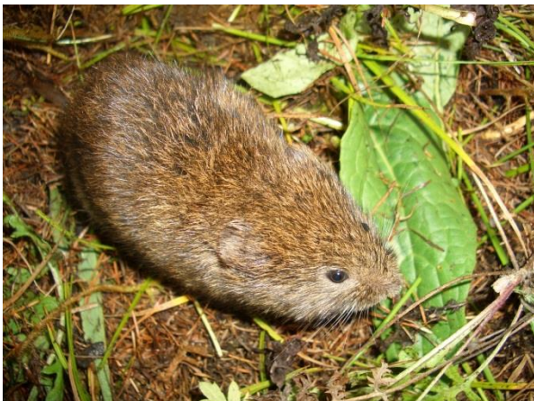
Figure 4. Meadow vole.

Mice should not be confused with voles (Fig. 4). Voles have stocky builds, blunt noses and short tails (long-tailed voles being the exception). Their ears are less pronounced, often with only the top half visible above the fur. Voles rarely enter structures but may be found in adjacent landscapes.