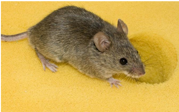
Figure 1. House mouse.

House mice (Fig. 1) are small rodents that weigh slightly less than an ounce and average 6½ inches in length including a three-inch tail. Though not native to the United States (they originated in Asia), house mice are adaptive enough to human environments that they can be found wherever people are throughout Montana. House mice reproduce year-round. Females can have four to six litters of five to seven young each year.