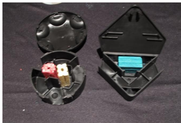
Figure 12. Two different styles of bait stations for mice designed for indoor use.

EPA regulations require that all rodenticides be applied in a manner to reduce access by non-target animals. Bait stations (bait boxes) are designed to protect bait from non-target access (Fig. 12).