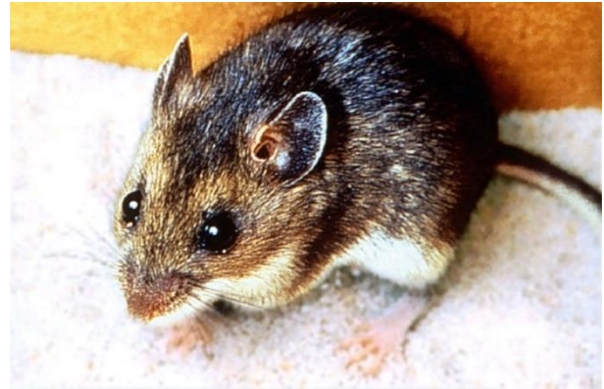
Figure 2. Deer mouse.

activities. Deer mice are native to Montana and may be found throughout the state from the grasslands to the mountains. Deer mice may be identified by the sharp color line on their tail, from brown on the top to white on the bottom. The house mouse tail is brown and grayish, without a sharp line. Female deer mice have three to four litters per year with three to five young per litter. Populations tend to spike in the fall.