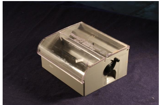
Figure 11. Tomcat multiple live catch mouse trap.

Multiple-capture traps for mice, such as the Victor Tin Cat ® , Ketch-All ® and Tomcat ® (Fig. 11) can catch several mice at a time without being reset, thereby reducing labor requirements.