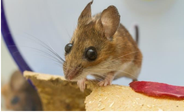
Figure 3. White-footed mouse.

Mice should not be confused with voles (Fig. 4). Voles have stocky builds, blunt noses and short tails (long-tailed voles being the exception). Their ears are less pronounced, often with only the top half visible above the fur. Voles rarely enter structures but may be found in adjacent landscapes.