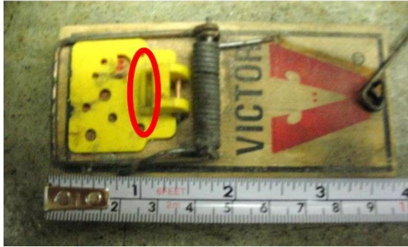
Figure 10. Place bait in the cup identified by the red circle.

and unset traps in areas where mice are active. Check traps each morning as mice are most active during the evening. Rebait as needed. Add additional traps in areas where activity is high. After a few baiting cycles, set all the traps. Experience has shown that this method increases the speed of trapping programs.