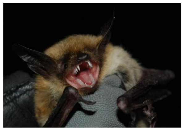
Figure 3. Bat teeth are very thin.

Always capture bats found in rooms with individuals that were sleeping, with diminished mental capacity (such as with alcohol) or young children as they may have had contact with a bat without their knowledge. Research has suggested that sick bats are attracted to intermittent noise, such as snoring. Do not assume that victims or associates would be able to see bite marks. Bats have needle-like teeth that leave marks difficult to see even when you know where the individual was bitten (Fig. 3).