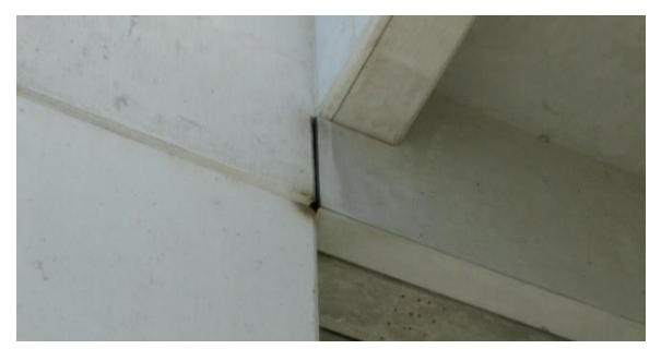
Figure 4. Notice the dark smudge at the bottom of the seam.

If the clues suggest that you may have bats residing in your home, then your next step is to confirm their presence.