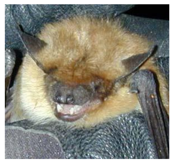
Figure 1. Big brown bat.

caves, logs, crevices, cracks, and holes in trees. Clearing of forests and other human activities has reduced the number of natural roosting sites for bats. Thus, some bat species have turned to roosting in buildings and other structures, such as the big brown bat (Fig. 1).