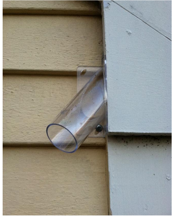
Figure 7. One-way plastic valve which allows bats to leave a structure but not to reenter.

Begin sealing all entries except the exits used by the bats. Install one-way doors on those exits to allow bats to leave but not return. After several days, remove the devices and plug the holes permanently. Use of smooth tubes is a common way to exclude bats as shown by the BatCone<sup>®</sup> (Fig. 7).