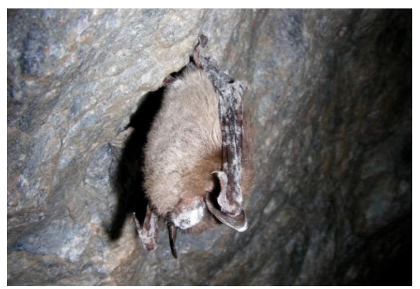
Figure 8. A little brown bat infected with the fungus that causes white-nose syndrome (see the white on its nose).

White-nose Syndrome is disease that affects bats, which ultimately leads to their untimely death. The syndrome is caused by a fungus that attacks the skin of bats (Fig. 8). The irritation of the fungus wakes them up during the hibernation period which forces them to use up precious fat reserves needed to survive the winter.