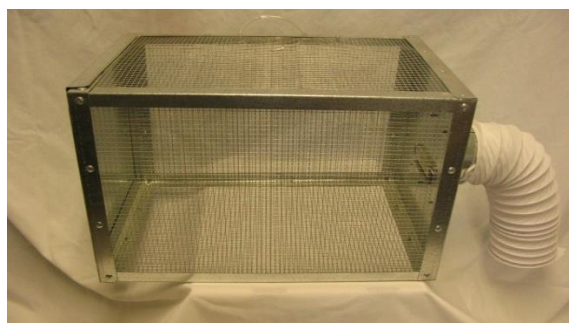
Figure 9. Bat trap.

Bat traps are devices used to capture bats as they exit the structure (Fig. 9). Advocates of bat trapping say that bats can be removed and translocated to another area.