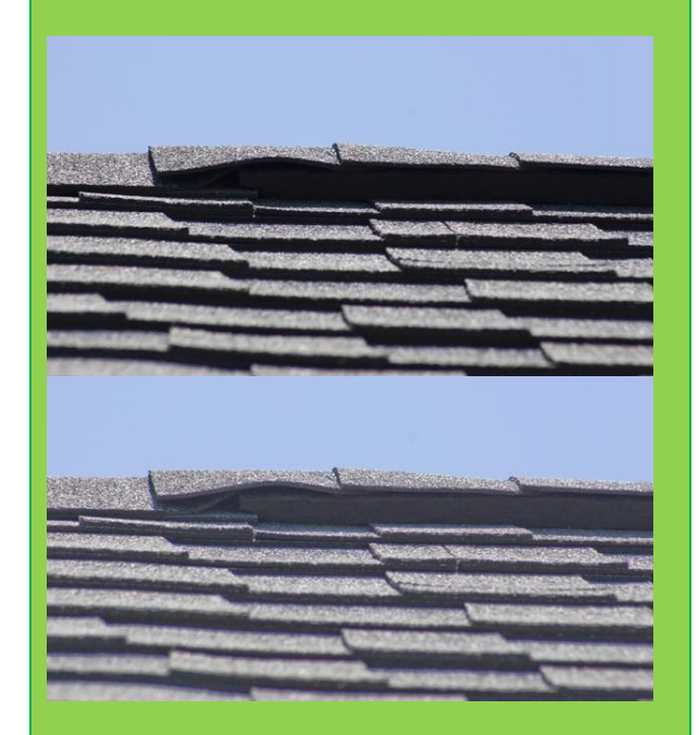
Top photo: Ridge vent before illumination: Bottom photo: Ridge vent after illumination. Note how the hole, which can allow bat entry becomes visible.

When looking for gaps in a structure, it can be helpful to know that shining a bright light at a dark spot will reveal whether it is a true hole or not. If a dark spot remains dark after illumination, then the location is a hole. If you see the building reflect back, then you know it wasn't a hole. Notice how illumination shows the gap in this ridge vent.