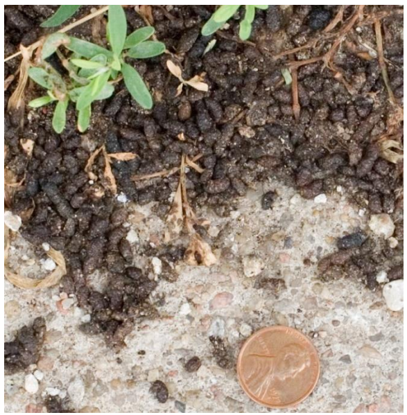
Figure 5. Bat droppings, known as guano.

absence of evidence is not evidence of absence. Frequently houses with small infestations of bats will leave little sign for you to find.