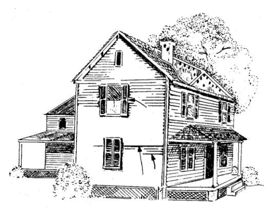
Figure 6. Potential bat roost sites in a structure.

Normal bat entry points, especially on older homes, include: