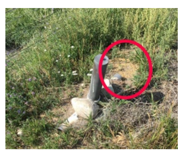
Figure 6. Grain bait outside the bait station.

Scattering Bait Before Station Entrance. Bait (toxic or not) should not be scattered outside the station to lure animals to the station (Fig. 6). Placing bait outside the station defeats its purpose by increasing hazard to non-target animals and exposing the bait to weather.