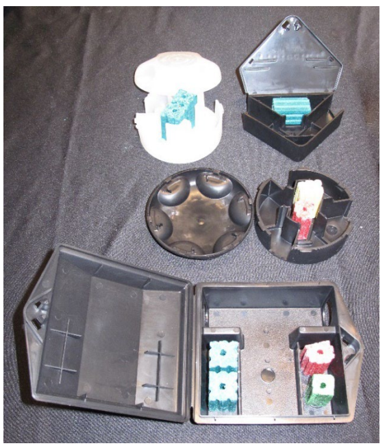
Figure 1. Mouse stations (top three stations) and a rat station (bottom).

Bait stations come in different sizes, shapes and colors (Fig. 1). Bait stations also differ in their ability to resist tampering. The Environmental Protection Agency (EPA) categorizes bait stations based on their ability to withstand tampering and weather (Table 1). Some only protect bait from dust (Tier 4) while others protect bait from children and pets (Tier 1). Select bait stations appropriate to the threats they could face. For instance, if your station will be indoors in a locked room, then you will only need a Tier 4 rated station.