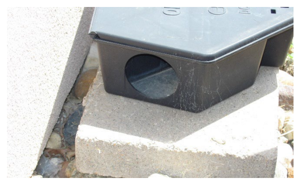
Figure 2. This Bell Labs Protecta® station is secured to a concrete block.

Bait stations may be secured against movement and shaking by soil anchors, screws, weights (Fig. 2) or magnets (Fig. 3).