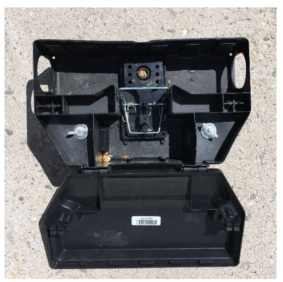
Figure 4. This Liphatech Aegis® bait station is opened to show how it can hold a snap trap.

Bait stations come in a variety of colors and shapes (Fig. 5) to help them blend in with the landscape.