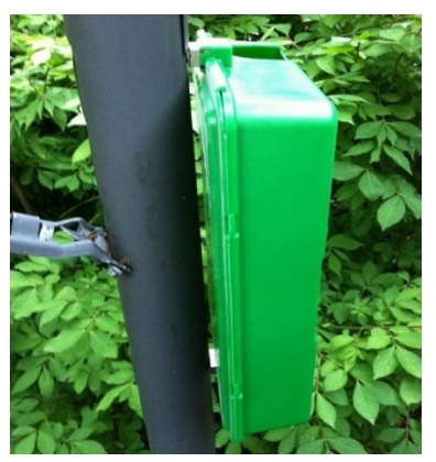
Figure 3. The Raptor 357® bait station uses strong magnets to secure the station to metal objects.

Bait stations have features that allow them to hold snap traps (Fig. 4), bait trays, and even devices to capture other animals, such as mice.