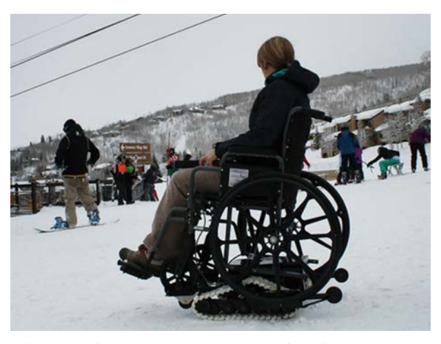
The Freedom Trax FT 1 Pro on the slopes, courtesy of the livingspinal.com website.

The Freedom Trax FT 1 Pro track attachment for manual wheelchairs is made in the United States and comes with a 24 volt lithium battery, two 24 volt motors, and a handheld joystick and charger. The track attachment can be adjusted for wheel-widths between 18 and 26 inches, making it a great long-term choice for users who anticipate updating their wheelchairs. The track itself is roughly eighty pounds and can handle sand, snow, hiking trails, and more. The lithium battery lasts up to eight miles on soft soil with backup batteries available for purchase. \diamondsuit