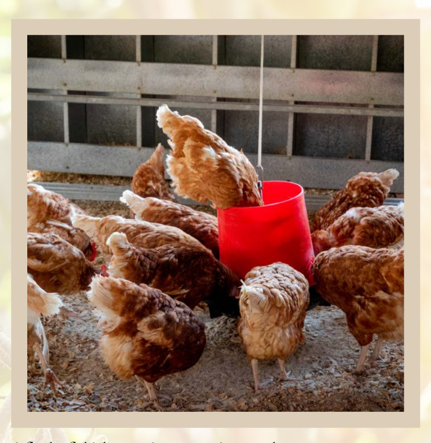
A flock of chickens enjoy a morning snack.