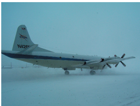
Whose idea was this?!? P-3 on snowy taxiway, Goose Bay, Labrador, Canada.