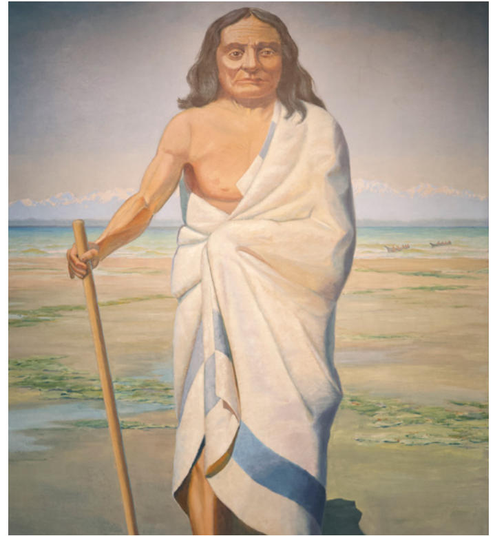
Chief Si'ahl painted by unknown

for the portrait of Chief Seattle in the Burke to tie another visual component to the welcoming of the Guest from the Great River .