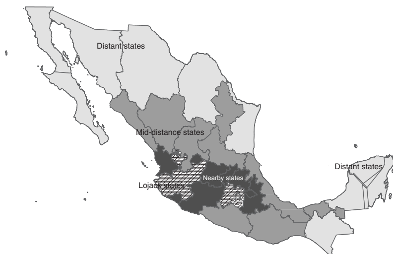
FIGURE 1. LOJACK STATES AND NON-LOJACK STATES

Notes: Non-Lojack states grouped by terciles of distance from state capital to nearest Lojack state capital.