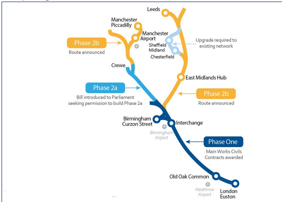
Figure 1- HS2 Route Map showing Phases One, 2a and 2b