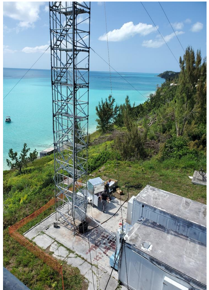
The BLEACH project leverages the BIOS-operated Tudor Hill Marine Atmospheric Observatory, which has operated since 1988 to collect year-round data on the chemical and physical properties of the atmosphere.

In late May 2022, scientists from the University of Washington, University of California at Los Angeles, the University of York (UK), and the National Oceanic and Atmospheric Administration (NOAA) traveled to Bermuda to begin the installation of a new 30-foot (10 meter) sampling tower and accompanying suite of state-of-the-art research instruments at the Tudor Hill Marine Atmospheric Observatory (THMAO) operated by the Bermuda Institute of Ocean Sciences (BIOS). The location on a remote island in the middle of the North Atlantic Ocean provides a valuable opportunity to study long-range transport of materials across entire ocean basins.