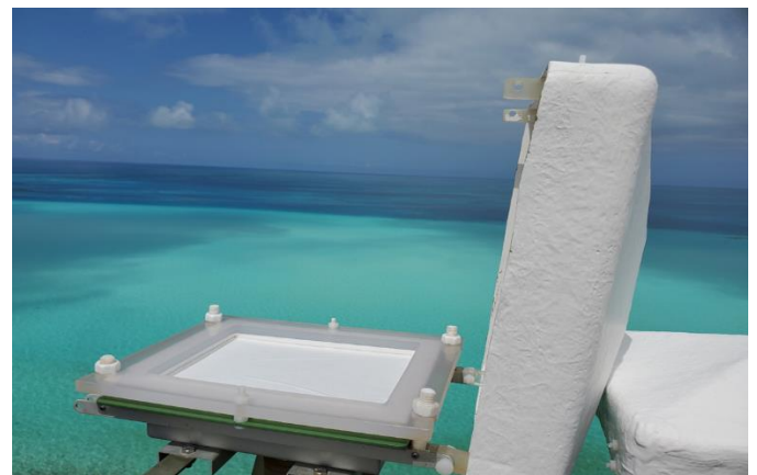
A high-volume aerosol sampler on top of a 23-m (65 ft) tall sampling tower at the Tudor Hill Marine Atmospheric Observatory. Filter samples are sent back to the UW to measure the chemical composition of the aerosol, including iodine, chloride, bromide, and sodium.

The observational data will be interpreted using numerical models run at the UW and the U. York to provide a quantitative understanding of the sources and sinks of halogens in the marine atmosphere. The combined observational and modeling approach will result in a more accurate assessment of the impact of halogen chemistry on the atmosphere and an improved capacity to predict the impact of climate change on the composition of marine air.