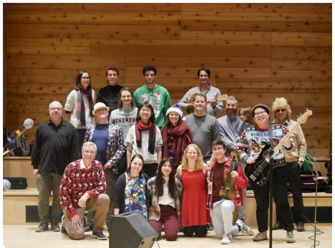
The 2022 UW Atmosphericers performed science and academia themed songs at the recent departmental winter social.

We will be hosting an Alumni and Friends Reception for our department at the 2023 Annual Meeting of the American Meteorological Society in Denver, CO, on Tuesday, January 10 from 7pm-9pm in Centennial Ballroom C. To ensure you receive an email invitation and reminder, please update your contact information by going to http://atmos.uw.edu/alumni or by contacting atmos@uw.edu .