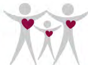
FAMILY & CONSUMER SCIENCES