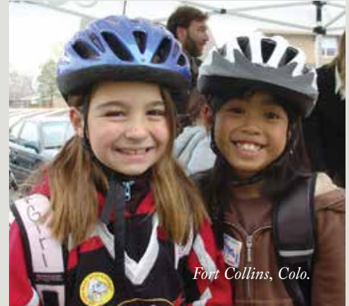
Fort Collins, Colo.