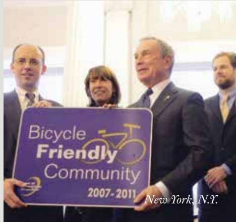
New York, N.Y.