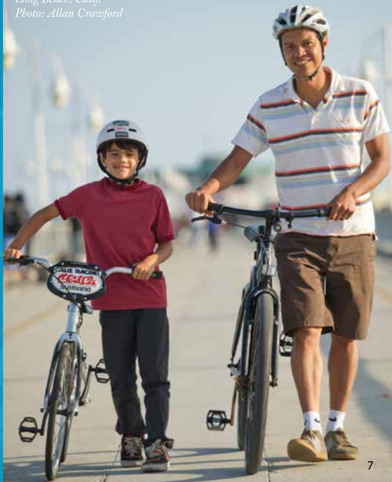
Long Beach, Calif.