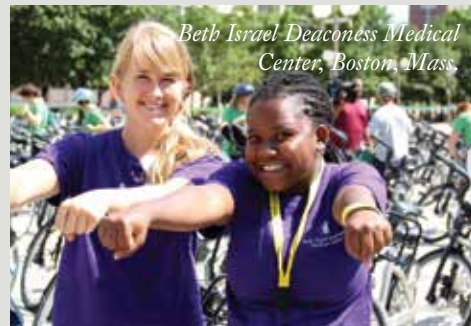
Beth Israel Deaconess Medical Center, Boston, Mass

The bicycle isn't just a great transportation option; it's an economic engine that can drive your business to higher profits, happier employees and more loyal patrons. Encouraging bicycling showcases your commitment to sustainability, healthy living and accessibility for all. And biking doesn't just enhance your bottom line — it makes your business a fun, engaging and exciting place to work or shop.