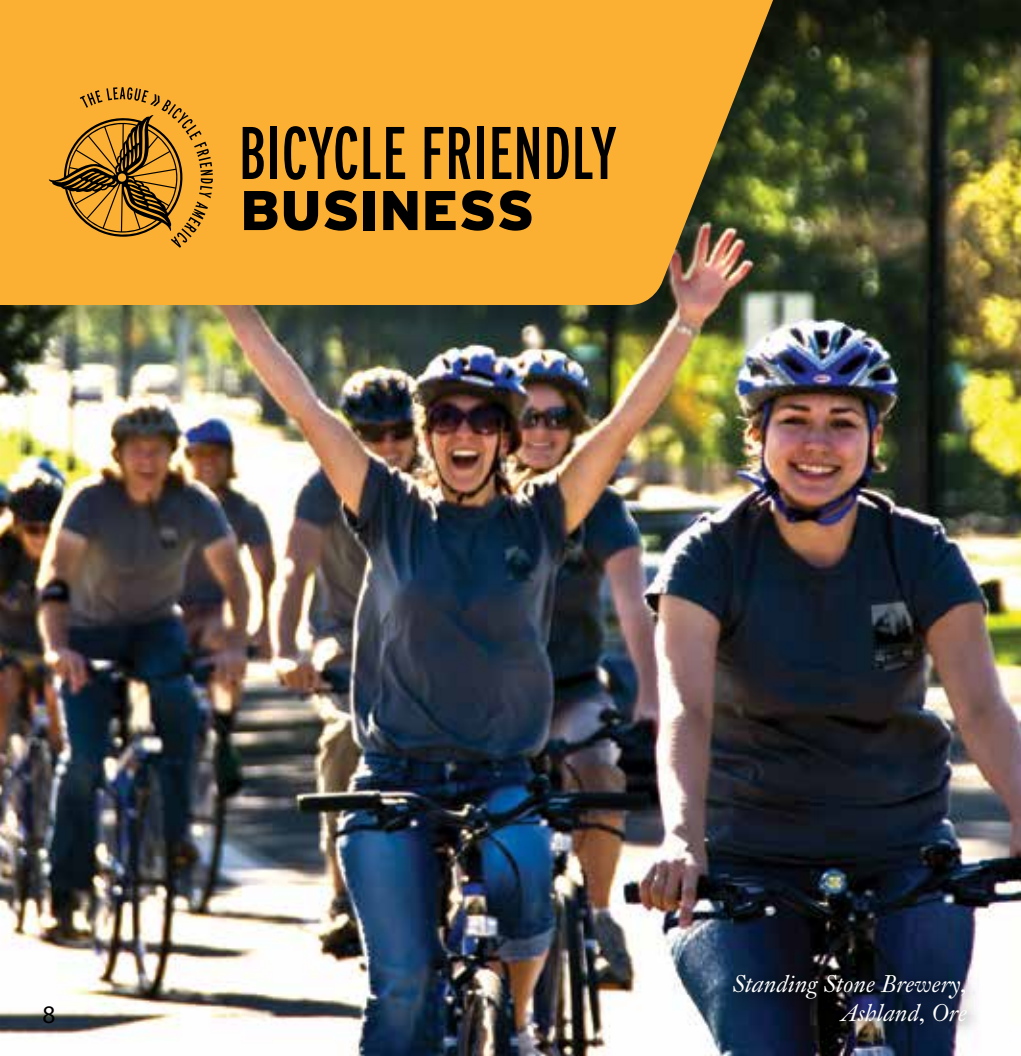
Standing Stone Brewery, Ashland, Or

Imagine your employees arriving at their desks energized, alert and more productive than ever. Picture your healthcare costs plummeting and staff morale skyrocketing. Envision customers flocking to your door instead of the competition. How do you get there? Start pedaling and become a Bicycle Friendly Business (BFB).