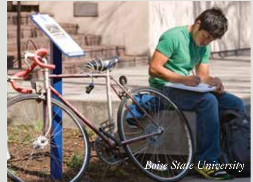
Boise State University

Turn to page 15 and fill out the BFU scorecard to see if your university is ready to apply. All applications must be submitted with the approval of the institution’s administration. Access the applications and additional resources at bikeleague.org/university .