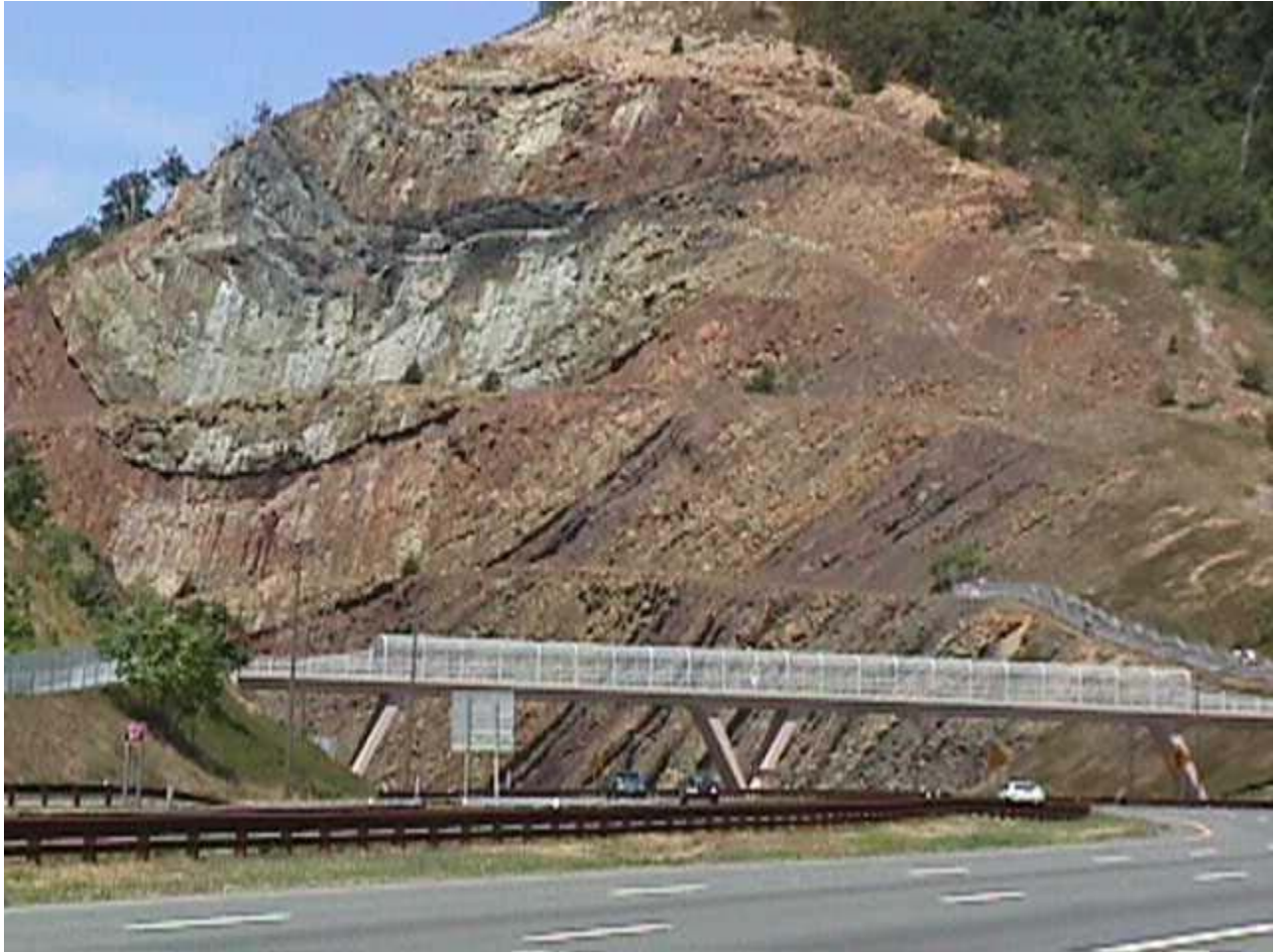
Syncline of folded Mississippian Rockwall and Purslane Formations in road cut, Sideling Hill Washington County, MD