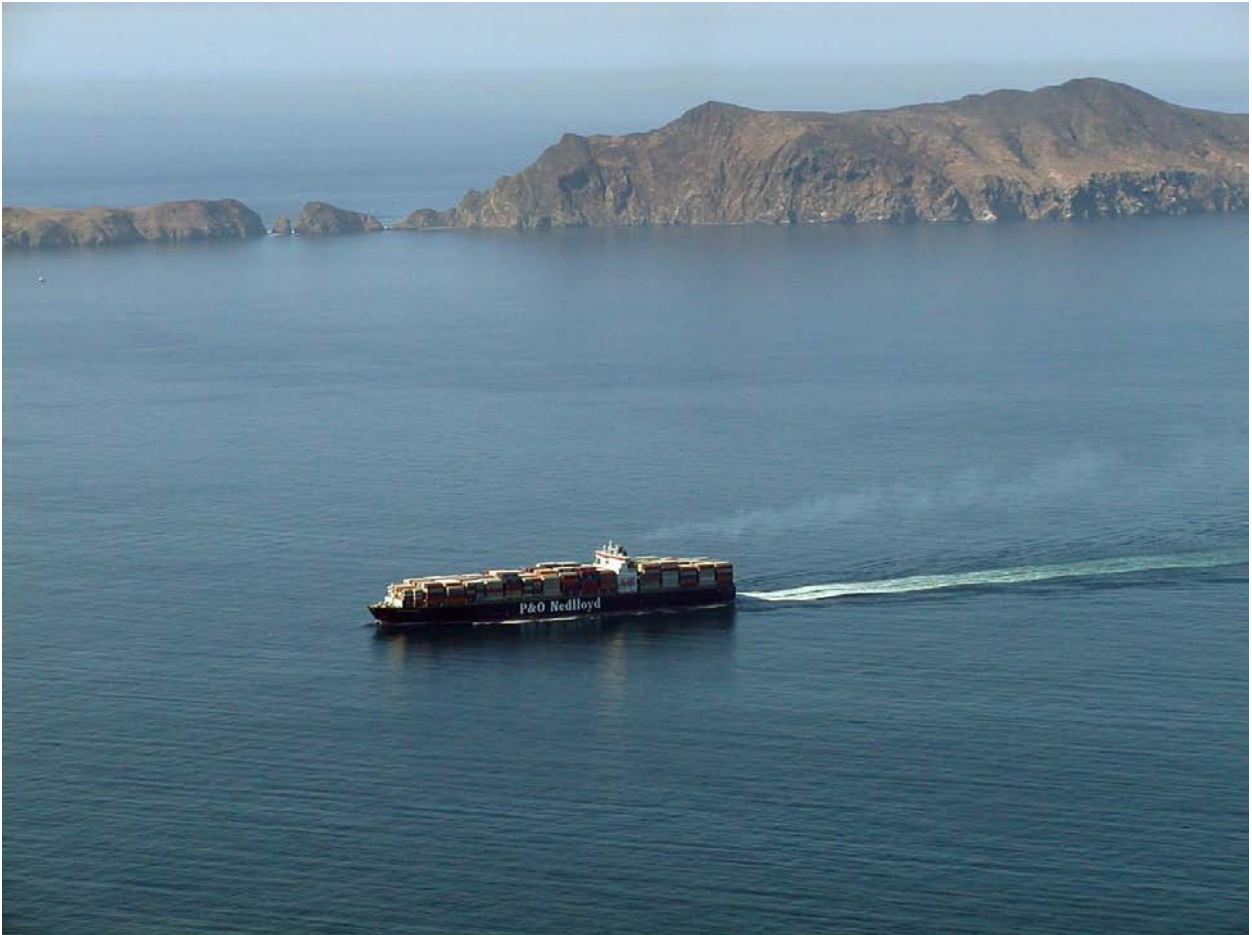
A loaded southbound container ship passing by Anacapa Island (photograph courtesy of Channel Islands National Marine Sanctuary).

and anthropogenic noise, and were thus extensively relied upon for the present discussion. Similarly, Marine Mammals and Noise (Richardson et al. 1995) exhaustively gathers and organizes marine mammal bioacoustics science up to its date of publication, and is thus the core text for understanding many fundamentals of the field. These works are recommended for further information on anthropogenic noise and marine ecology.