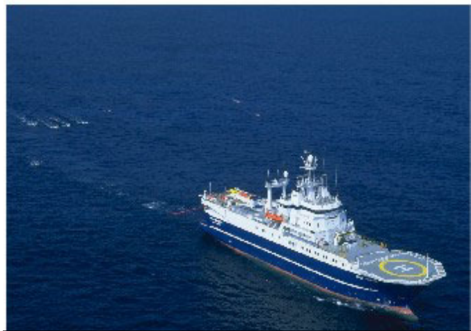
Seismic surveying. Note towed airgun array.

Seismic-surveying involves synchronized firing of a towed airgun array. Airguns fire quantities of high-pressure (approximately 2000psi) air vertically into the water, directing 10Hz-300Hz (low-frequency) impulsive sounds toward the sea floor so that sound waves penetrate the geology and reflect back to sensors (Lissner and Greene 1998). Analysis of received echoes provides sub-sea geologic imagery, and thus yields information such as the presence of extractable hydrocarbons (oil and natural gas) and tectonic characteristics (WDCS 2003, NRC 2003). Peak source levels for seismic surveying typically exceed 200 dB, and exceed 250 dB in some surveys with a high total array volume (combined volume of all guns in the array, a number that captures both the size of the guns and number of guns involved) (Engås et al. 1996).