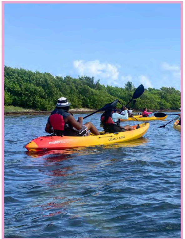
Community members participate in a free kayak tour of Salt River.

The week began with a kickoff event and community created ocean-inspired art gallery. The US Fish and Wildlife Service sponsored free kayak tours throughout the week, and the St. Croix Environmental Association ran a snorkeling clinic. The East End Marine Park hosted 100 summer campers for an outdoor field day. Community members were able to tour The Nature Conservancy's Coral Hub, youth SCUBA divers were signed up for a free guided dive at the Frederiksted Pier, citizens came together for a beach cleanup, and the Department of Planning and Natural Resources' signature Eco-Van popped up in Christiansted for an outreach day. The week concluded with a coral talk and an outdoor movie night. Through challenges such as thunderstorms, strong winds, and high tides, overall this week was a big success!