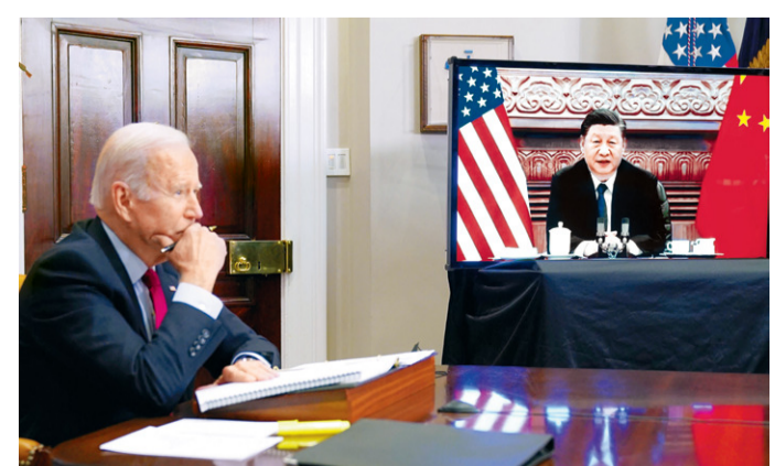
Joe Biden and Xi Jinping speak via video link last November. The two presidents are expected to meet in person this autumn.

"Still, everyone I know in Washington wants to avoid an armed conflict and therefore is recommending Taiwan to keep the status quo," he said.