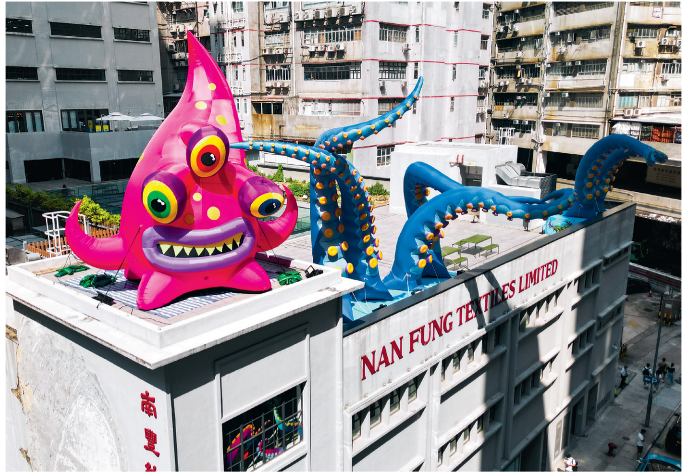
Giant sea monsters look out from the roof of the Mills in Tsuen Wan, as part of an exhibition co-hosted by the arts hub and British inflatables group Designs in Air.