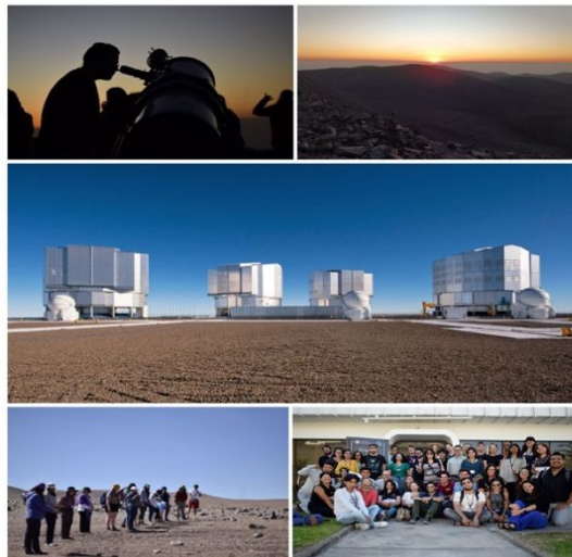
From left to right: 1. Telescopes from UCN 2. Sunset 3. The four Very Large Telescopes at Paranal 4. Searching for meteorites 5. Participants and lecturers on the last day of the Capacity Building Workshop

"The aim of the workshop was to develop interesting scientific projects guided by experts from missions such as Hayabusa 2, Mars Express, JUNO, New Horizons and DART"