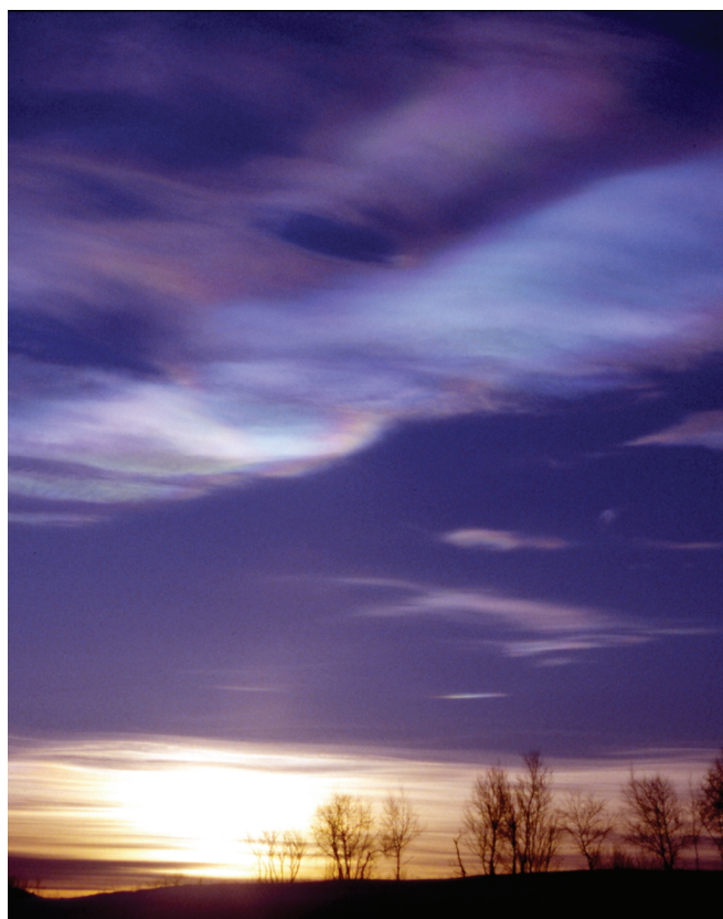
Figure Q9-2. Polar stratospheric clouds. This photograph of an Arctic polar stratospheric cloud (PSC) was taken in Kiruna, Sweden ( 67^{\circ}\text{N} ), on 27 January 2000. PSCs form in the ozone layer during winters in the Arctic and Antarctic, wherever low temperatures occur (see Figure Q9-1). The particles grow from the condensation of water, nitric acid ( \text{HNO}_3 ), and sulfuric acid ( \text{H}_2\text{SO}_4 ). The clouds often can be seen with the human eye when the Sun is near the horizon. Reactions on PSCs cause the formation of the highly reactive gas chlorine monoxide (ClO), which is very effective in the chemical destruction of ozone (see Q7 and Q8).