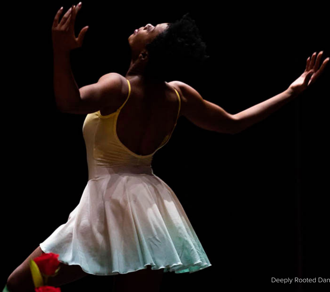
Deeply Rooted Dance Theater