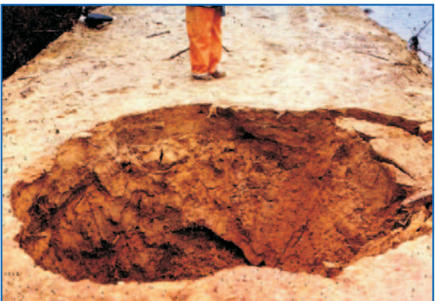
Sinkhole which developed over a spillway conduit.