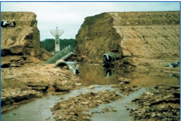
Failure of an embankment dam due to the discontinuity represented by the conduit.

A conduit can develop defects from deterioration, cracking from foundation compressibility, or joint separation due to poor design and construction. Water leaking from defects in conduits can contribute to seepage pressures exceeding those that occur solely from flow through soils in the embankment dam from the reservoir. When preferential flow paths develop in the earthfill through which water can flow and erode the fill, severe problems or breaching type failures often result.