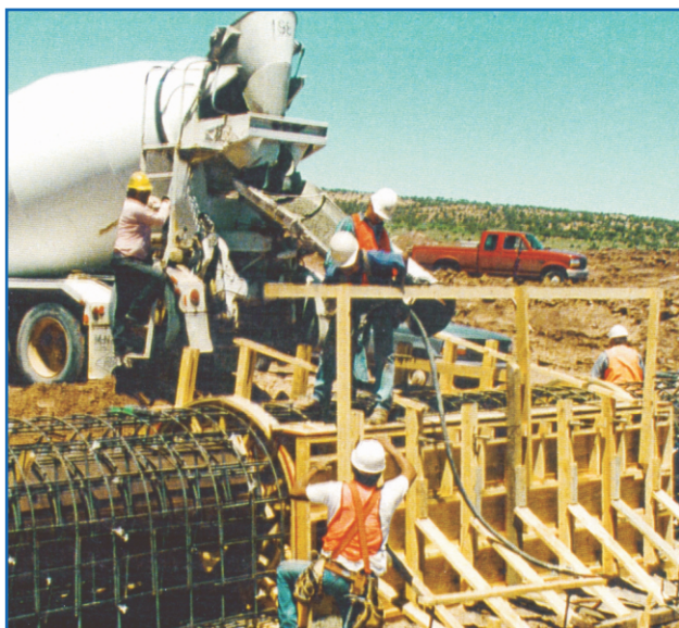
Concrete placement for a reinforced cast-in-place conduit.