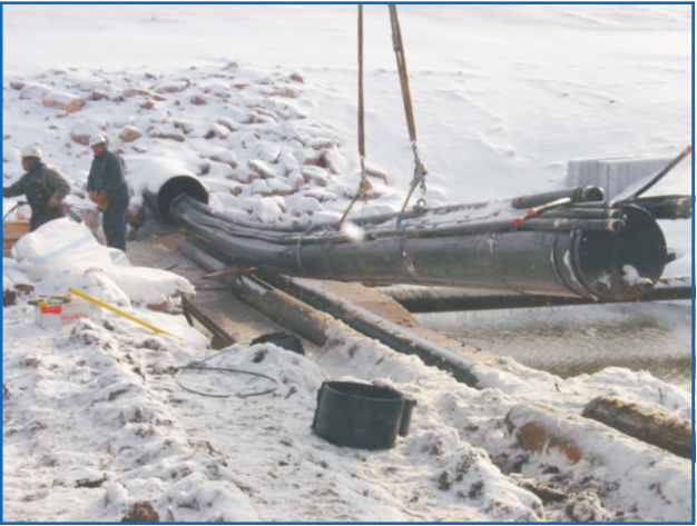
Insertion of a high density polyethylene (HDPE) slipliner into an existing outlet works conduit.