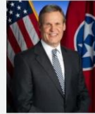
TENNESSEE Governor Bill Lee