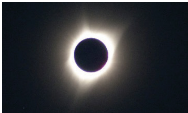
Total eclipse showing solar corona as the Moon passes in front of the Sun and completely covers the Sun's surface

Photo by Cary Sneider during August 2017 Eclipse