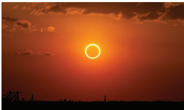
Annular eclipse showing ring of solar surface (ring-of-fire) still visible as Moon passes in front of the Sun

In 2017, many administrators were unprepared when their science teachers asked to take students outside to view the eclipse. So, for the upcoming eclipses, we’ve prepared this document to give you the background you need to help your teachers make the two eclipses an unforgettable learning experience.