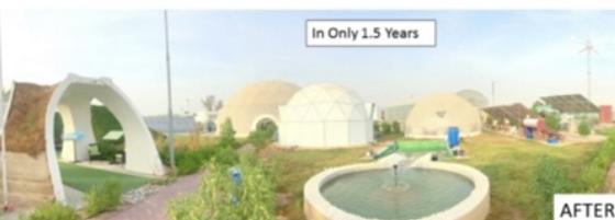
1.5-year transformation of a previously infertile desert using Undersert's SWAP technology.

The Sharjah site (4000m 2 ) is now a small oasis with plants, bushes, food, fresh water and homes.