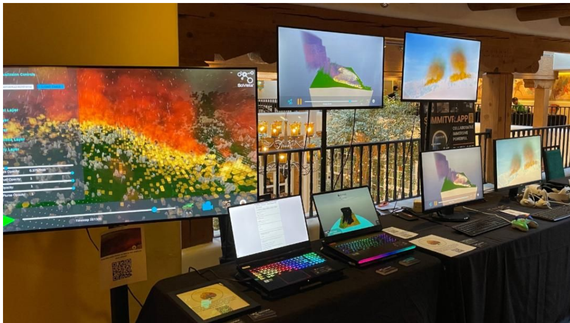
SciVista demonstrating their technology at the 4th Annual Southwest Fire Ecology conference.