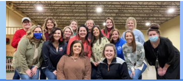
Picture Above is of the Modern Homesteading Homemakers Club

According to its website, the Kentucky Extension Homemakers Association (KEHA) is a volunteer organization that works to improve the quality of life for families and communities through leadership development, volunteer service, and education. County homemaker organizations provide leadership opportunities to its members through filling an office, teaching a lesson, chairing an activity, and being a part of many local associations. Most importantly, it provides companionship and lifelong friendships for most of its members.