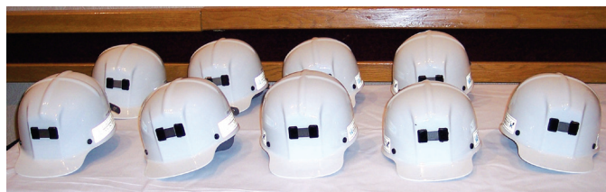
Upon graduation, students receive a Mining Engineering hard hat