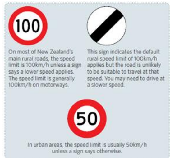
Speed limit signs in New Zealand