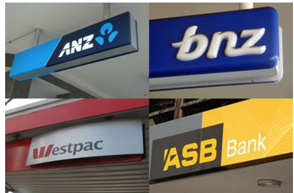
Most common banks in Christchurch

While New Zealand has converted to chip-and-pin style credit and debit cards, you may still use U.S. cards with magnetic strips. The only slight exception is at 24-hour gas stations. If there is no attendant, you must either pay with a chip-and-pin card or with a magnetic strip card that has a PIN number associated with it.