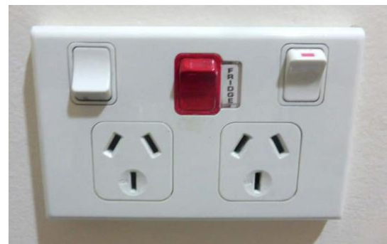
Typical outlet in New Zealand

In other places, electrical plugs supply 230 volts, 50 Hz, and they use an angled two-pin or three-pin plug, the same as in Australia (see photo). Note that the outlets are typically switched off, and must be manually turned on.