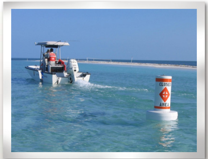
Some areas in the refuge are closed to entry to protect wildlife and habitats.

Predation may play a role in mortality of nestlings in Florida Bay. An analysis using only nests that were successful in producing young revealed that the number of surviving chicks per nest was similar in the refuge and bay. This observation implicates predation as a cause of mortality because predation would likely result in the loss of all young from the nest, whereas reduced food supply would probably result in some young surviving. Researchers noted the high prevalence of crows on or near nesting sites in Florida Bay and suggested that nest failures during this study may have resulted from predation by crows on unattended nests when birds were flushed by some disturbance, including from passing motor boats.