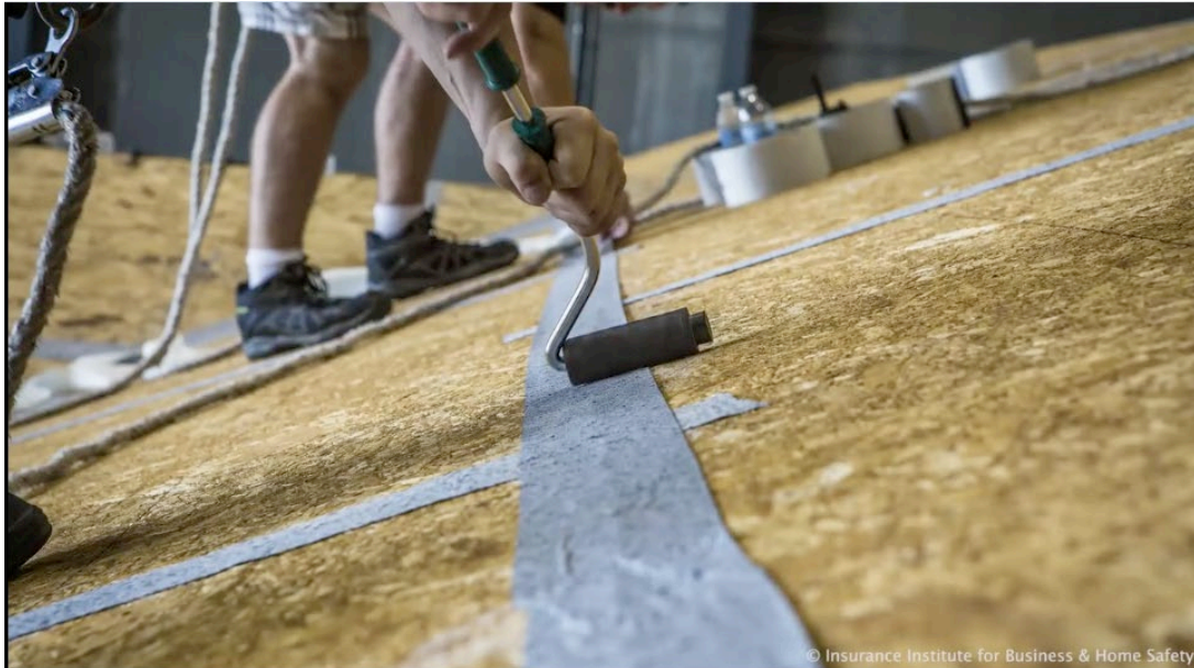
Figure 2. Installing a sealed roof deck system; taping the seams of roof sheathing.

Sealed Roof Deck Option 2- Self Adhered Membrane: Cover the entire roof deck with a full layer of self-adhering polymer-modified bitumen membrane meeting ASTM D1970 requirements. This approach provides a waterproof membrane over the entire roof and can greatly diminish the potential for leaks. In some instances, the ability of the self-adhered membranes to adhere to oriented strand board (OSB) sheathing may be compromised by the level of surface texture or wax used in fabricating the OSB panels. In applications where membrane adhesion to OSB is marginal, apply a manufacturer-specified compatible primer to the OSB panels to ensure the proper attachment of the self-adhering membrane to the sheathing.