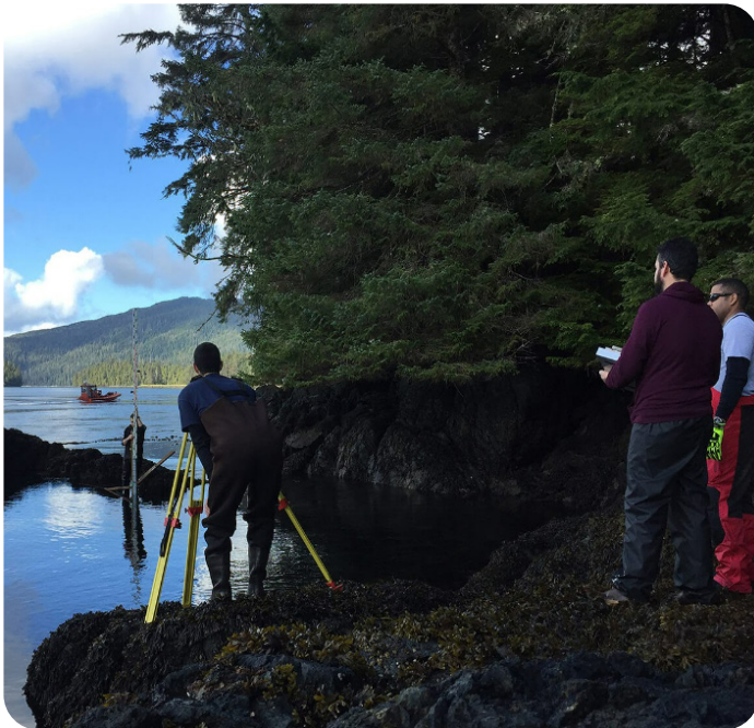
Fig. 2: Surveyors mapping coastlines using the datum to determine marine boundaries.

The International Great Lakes Datum (IGLD) is a common vertical reference used throughout the Great Lakes - St. Lawrence River system to measure water levels. IGLD was first released in 1955 by the Coordinating Committee on Great Lakes Basic Hydraulic and Hydrologic Data, a bi-national committee dedicated to joint water resource management. IGLD (1955) was updated to IGLD (1985) in 1992. IGLD (1985) is scheduled to be replaced by IGLD (2020) around 2027. The updated IGLD will be compatible with national datum frameworks used in both countries, including the upcoming North American - Pacific Geopotential Datum of 2022, which is planned to be adopted in the US in 2025, and the existing Canadian Geodetic Vertical Datum of 2013, in use in Canada.