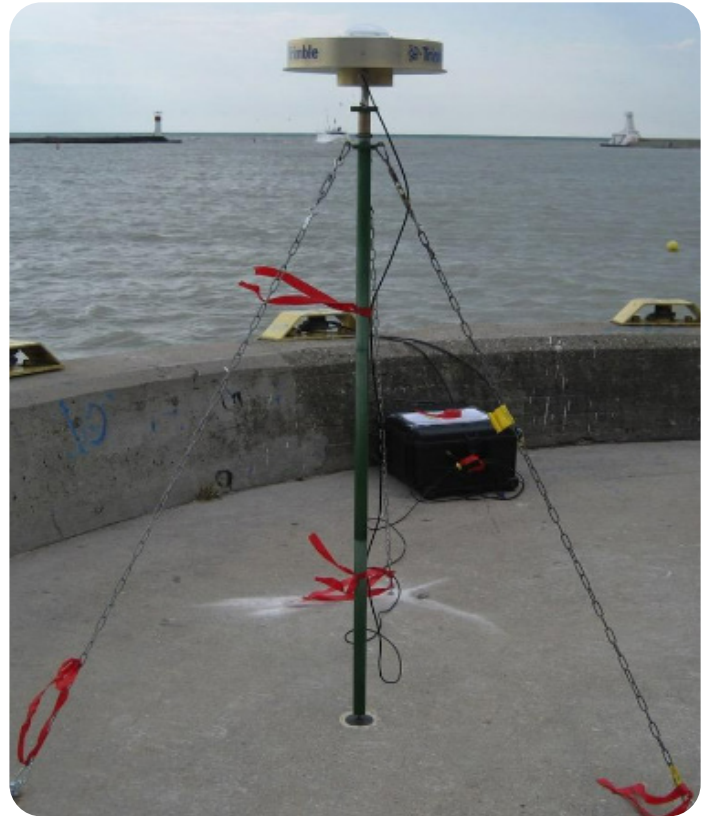
Fig. 3: Typical GNSS set-ups in U.S. and Canada.