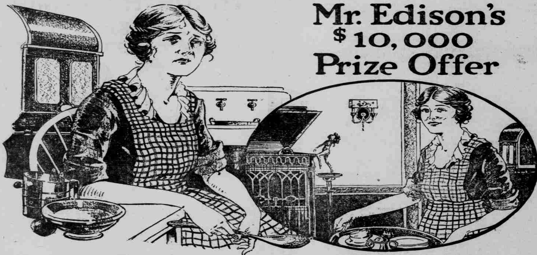
Too tired to get dinner