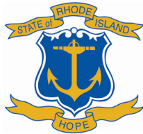
Daniel J. McKee Governor