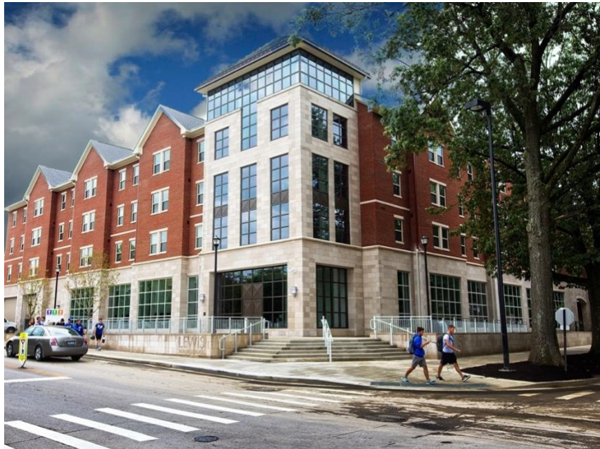
Lewis Hall, Home of the Lewis Honors College

Founded in 1865 as a public, land-grant institution adjacent to downtown Lexington, the University of Kentucky (UK) is dedicated to improving lives through excellence in education, research, creative work, service, and health care. Nestled in the scenic heart of the beautiful Bluegrass region, UK plays a critical leadership role by promoting diversity, inclusion, economic development, and human well-being. The UK campus has grown significantly in the last decade to cover 3 million square feet and $6 billion of new space on campus. UK is the home to more than 31,000