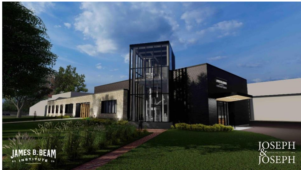
By May 2024 the University of Kentucky's new James B. Beam Institute will be open on campus.

Optional. An afternoon field trip to a Kentucky Bourbon Distillery, followed by dinner, will be available for an additional fee, approximately $100 all inclusive.