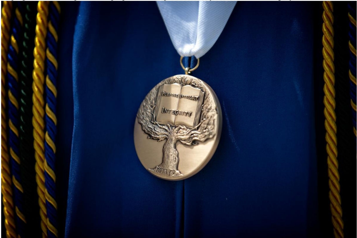
The Lewis Honors College Medallion inscribed with the words "Purpose, Intellect, Integrity" on a book held in the branches of the Tree of Knowledge.

The Mission of the Lewis Honors College is “to better the Commonwealth of Kentucky and the world by helping students to explore their purpose, develop intellectually, and lead with integrity.”