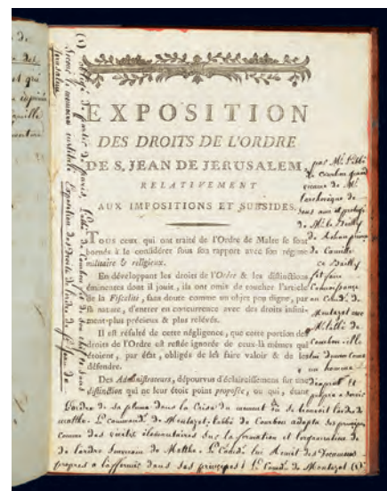
Exposition des droits de l'Ordre de S. Jean de Jérusalem relativement aux impositions et subsides . [France]: [1790?-1794?].