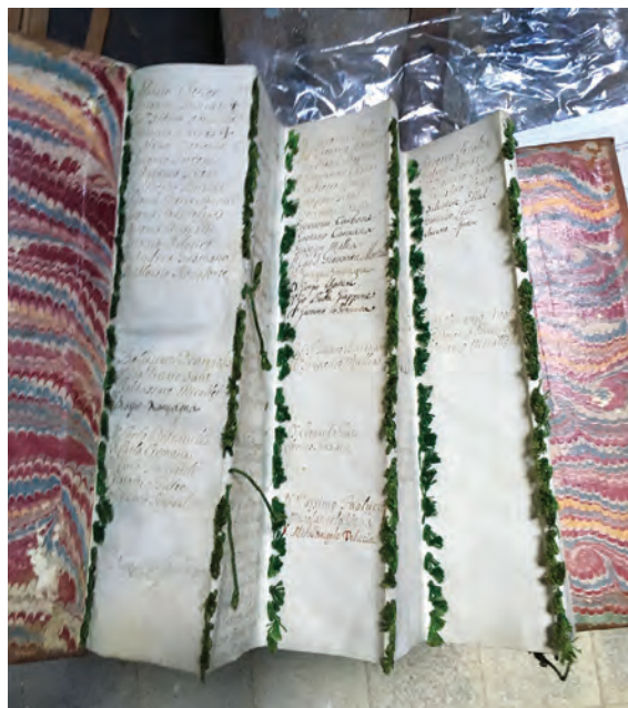
Top: Armoire of the Archives of the Archconfraternity of the Holy Rosary, Valletta, Malta