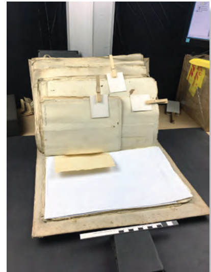
Above: Digitizing the Archives of the Confraternity of Charity in Valletta, Malta.

On the cover: "Fleet of the Order of Malta in Action near Jaffa," Valletta, Archivum de Piro. Box A17, bundle 1. 18th-century manuscript on paper