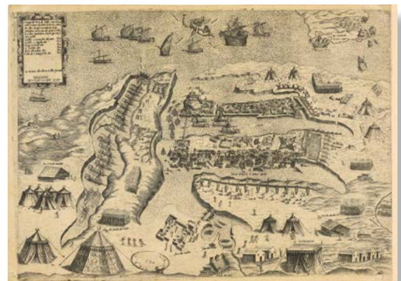
Above: "Heraldry Giovanni Francesco Camocio, Disegno del Porto di Malta (Venice: [1565]). Printed book on paper. HMML project number HMZA 00688.