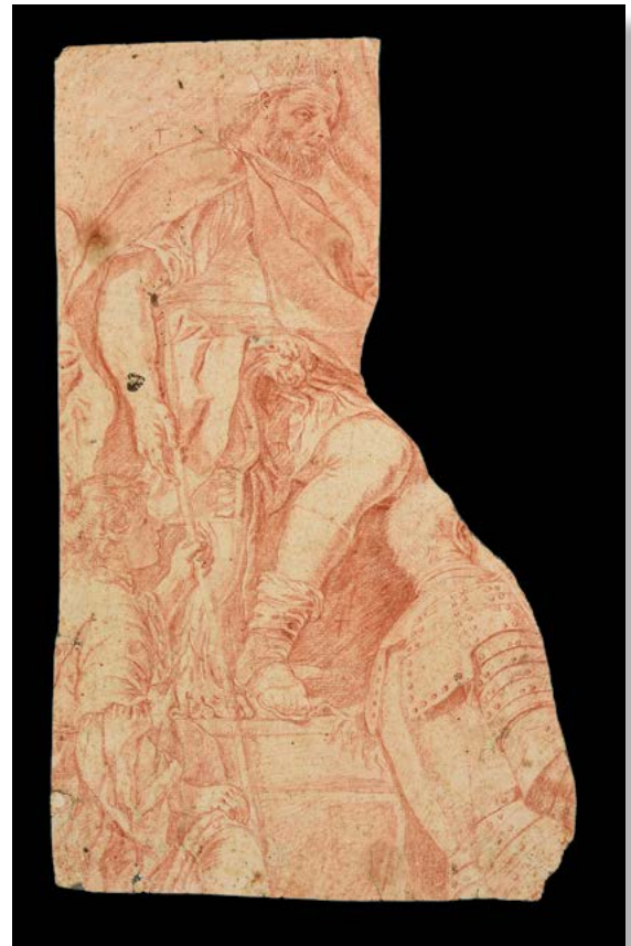
Above: "David Playing the Harp to King Saul." 17th-century drawing on paper. Copy after a painting by Mattia Preti. HMML project number HMZA 00021.