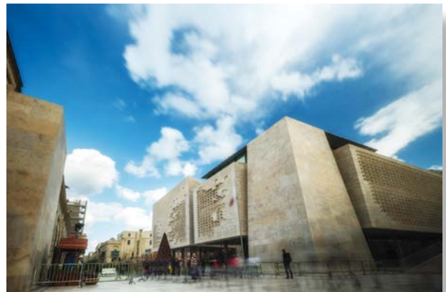
Above: The new Parliament of Malta, photograph by Stephen Busuttill, 2018.

Valletta belt u poplu was a project endorsed by the Valletta 2018 Foundation.