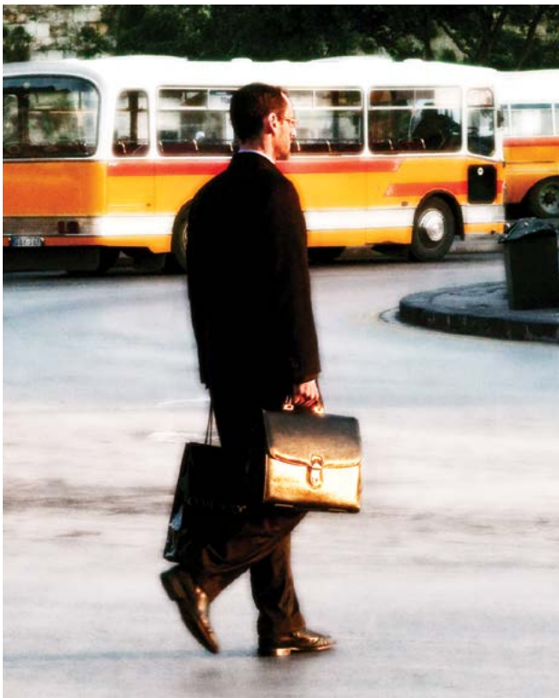
Above: Xarabanks (buses) and businessman near Triton Fountain, photograph by Stephen Busuttill, 2008.

In Valletta belt u poplu , Mr. Busuttill created a ten-year photographic retrospective of Valletta, depicting how the Maltese capital has changed religiously, culturally, and socially in response to unprecedented globalization over the last decade. The retrospective included photographs from his initial award-winning study of Valletta in 2008, which involved a twenty-four-hour photographic journey in the city, where one photo was taken each hour to document the city's life. The 2008 photographs were combined with new images taken during Valletta's celebration as European Capital of Culture in 2018.