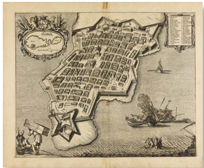
Above: Johannes Janssonius, "Valletta Civitas Nova Maltae olim Militae" in Theatrum celebriorum urbium Italiae, aliarumque in Insulis Maris Mediterranei . (Amsterdam: Ex Officina Joannis Janssonii, 1657). Printed on paper. HMML project number HMZA 00969.