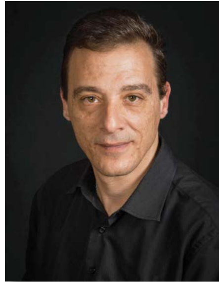
Above: Stephen Busuttill, photographer.

Mr. Busuttill's study revealed the rapid changes the city has undergone since joining the European Union. Photographs of festivals from 2008 and 2018 show the continuing importance of traditions particular to the Catholic heritage of the Maltese islands, including the feasts of saints and carnivals. Scenes of street life in Valletta, however, show the influence of globalization and the increasing role that tourism has played in organizing the daily life and business of the city over the last decade.