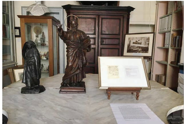
Exhibit for the "Receipt for the Medical Care of a Slave." Archivum de Piro. Box 13. Bundle 7. Item 2, dated 16 November 1726.