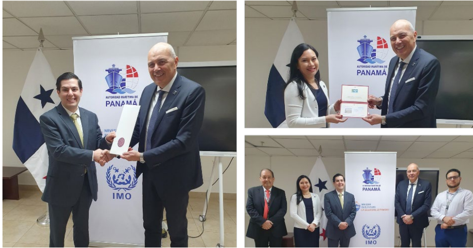
IHO Director and DGPIMA delegation – Panama City, Panama, 2 December 2024

The Dirección General de Puertos e Industrias Marítimas Auxiliares of the Maritime Authority (DGPIMA) of Panama assured the IHO that the process for the admission of Panama to IHO has restarted. The Council of Ministers prepared a law for the admission that will be presented to the National Assembly (Parliament) by the MFA and the Autoridad Marítima de Panamá in January 2025 for the approval. After three rounds at the Parliament, the law will be signed by the President of Panamanian Republic hopefully late in 2025. A Technical Visit to Panama to assess the status of the hydrographic capacity in Panama was considered as a potential follow up action in 2026.