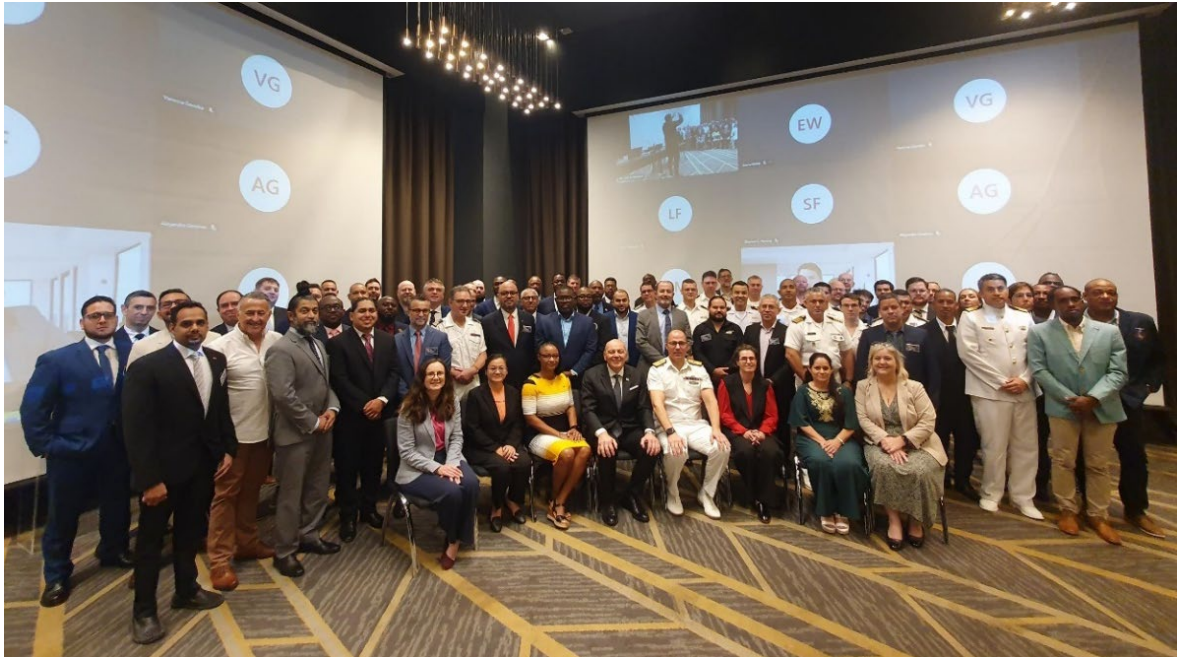
MACHC25 participants – Panama City, Panama