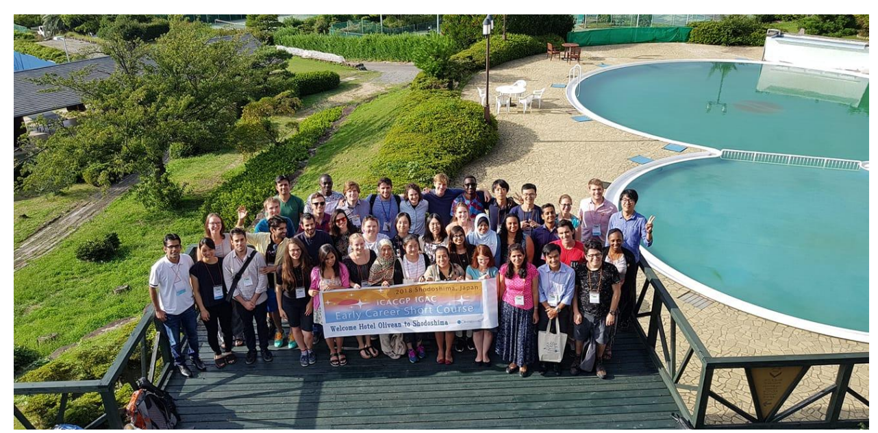
2nd iCACGP-IGAC Early Career Short Course Participants

borders. The friendship among the ECSC participants triggered further networking among all early career scientists at the 2018 joint 14th iCACGP Quadrennial Symposium/15th IGAC Science Conference.