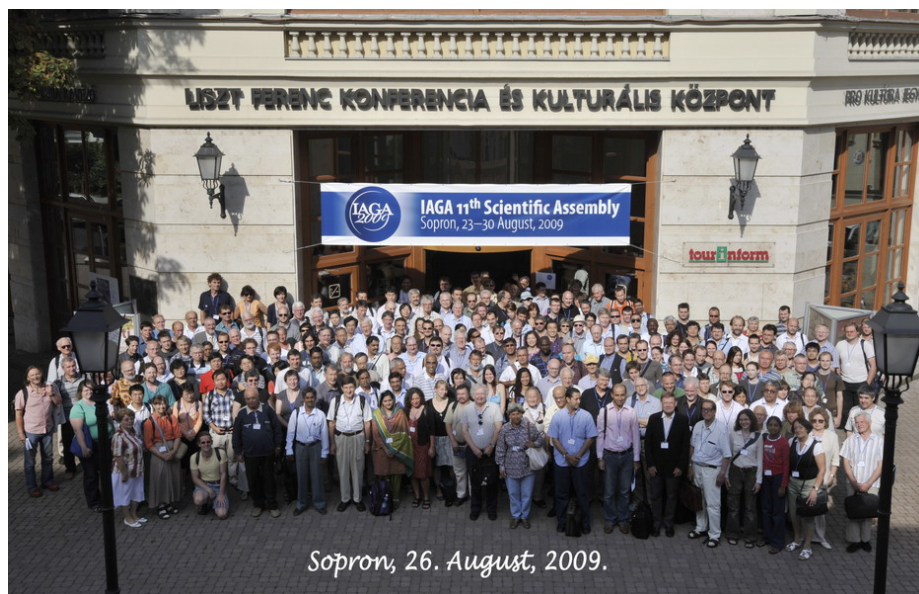
Participants of the IAGA Scientific Assembly