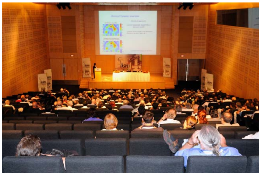
Plenary session at the IASPEI Scientific Assembly

There were 347 participants from 60 countries registered for the Assembly. Eighty three of them were students, young researchers and researchers from less-developed countries who were partially sponsored.