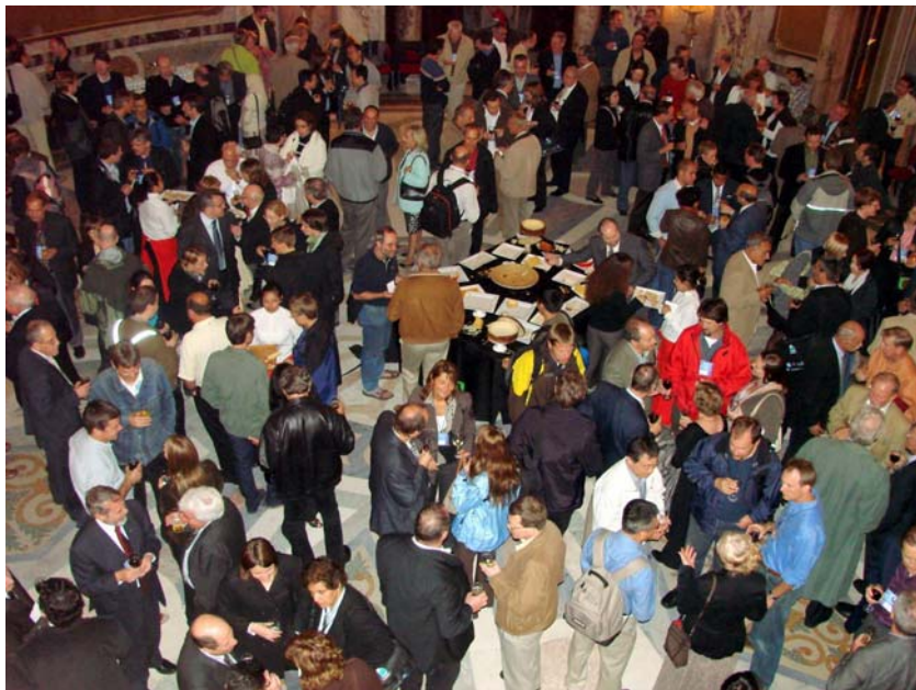
At the 2009 IAG Scientific Assembly