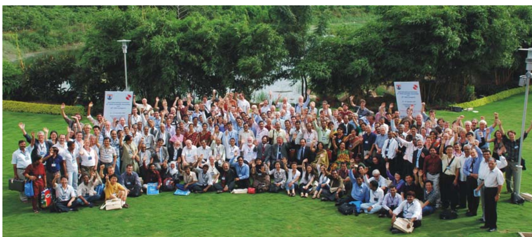
Participants of the Joint IAHS-IAH Convention in Hyderabad.