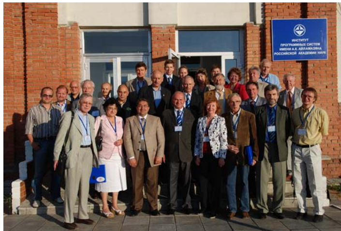
Group photo after the business meeting of the Russian National Committee for IUGG

attended by the observers from various Russian research institutions related to geodesy and geophysics. The IUGG Secretary General gave an interview for a local newspaper on the topic of how IUGG promotes activity of young scientists.