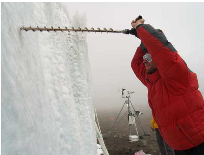
Studies of ice cores help to improve our understanding of climate dynamics and change

All three events will be supported by the IUGG.