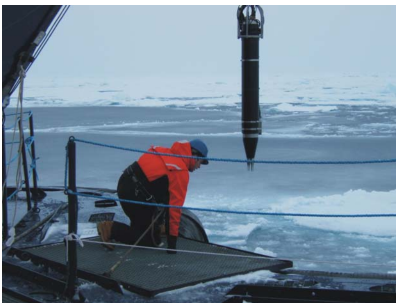
Seawater measurements assist in understanding of periodic changes in the atmosphere and ocean of the tropical Pacific region, such as El Niño and La Niña