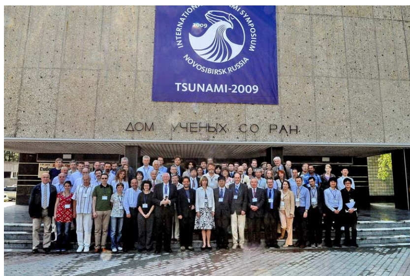
ITS-2009 participants at the entrance to the symposium venue

The scope of the 24 th Tsunami Symposium covered all the basic aspects of the tsunami phenomenon, be it scientific, technical, social or historical. Basic themes discussed at the symposium were: (1) Historical tsunami observations, catalogs and databases; (2) Tsunami measurements and field observations; (3) Geologic effects and records of tsunamis; (4) Tsunami probability and seismotectonic aspects of tsunami generation; (5) Non-seismic sources of tsunami; (6) Tsunami modelling - generation, propagation and run-up; (7) Tsunami impacts on coastlines; (8) Tsunami forecasting and real-time warning; (9) Methods of long-term tsunami risk estimates (coastal tsunami zoning), and (10) Tsunami mitigation and countermeasures.