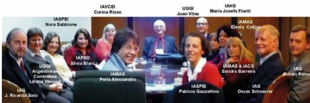
Group photo during the business meeting of the Argentine National Committee for IUGG