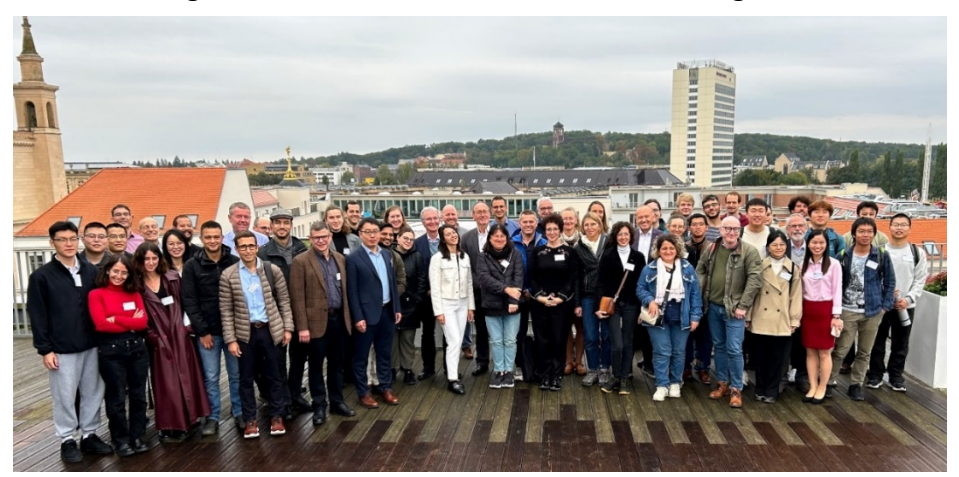
Participants of the GGOS Topical Meeting on the Atmosphere, Potsdam, Germany, 7-9 October 2024

The Global Geodetic Observing System (GGOS) of the International Association of Geodesy (IAG) convened geodetic and geophysical communities to participate in the GGOS Topical Meeting on the Atmosphere , held in Potsdam, Germany, 7-9 October 2024. The main objectives were a general brainstorming and in-depth discussions on the challenges and opportunities of integrating geodetic and geophysical technologies for a comprehensive monitoring of the lower atmosphere (i.e., troposphere and stratosphere), the mid-atmosphere (mesosphere) and the upper atmosphere (including thermosphere, ionosphere and plasmasphere). This Topical Meeting was organised as a main activity of the project Characterisation of the Ionised Atmosphere in terms of Essential Variables promoted by the International Union of Geodesy and Geophysics (IUGG) for 2024/2025 with the support of the International Association of Geomagnetism and Aeronomy (IAGA) and the IAG. The meeting was attended by 76 participants from 21 countries. 36 participants were early career scientists. Thanks to the generous support of the IUGG, the IAG and the IAGA, travel grants were provided to six colleagues to enable them to attend the meeting.