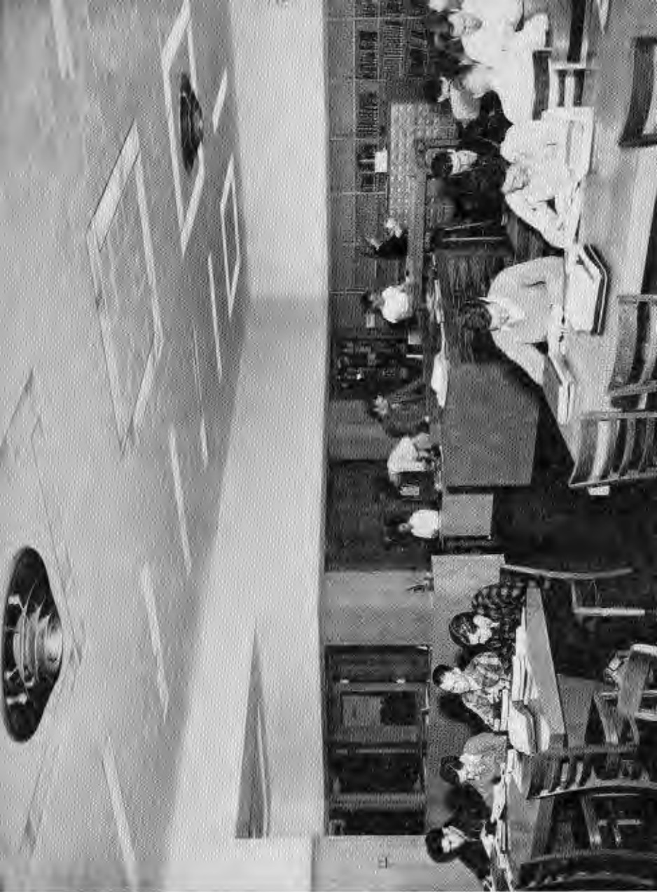
Section of the Forestry Library, Berkeley campus