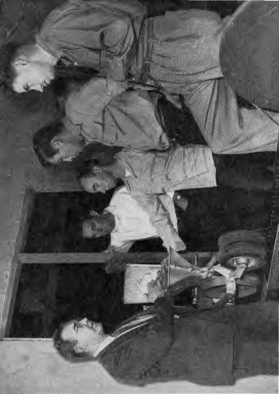
A seed-planting machine being demonstrated to a group of agricultural engineering students, Davis campus