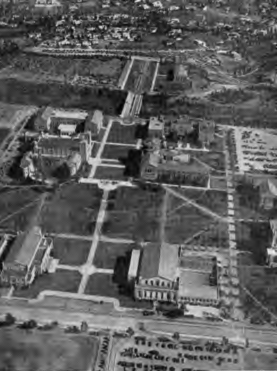
Air view of the Los Angeles campus