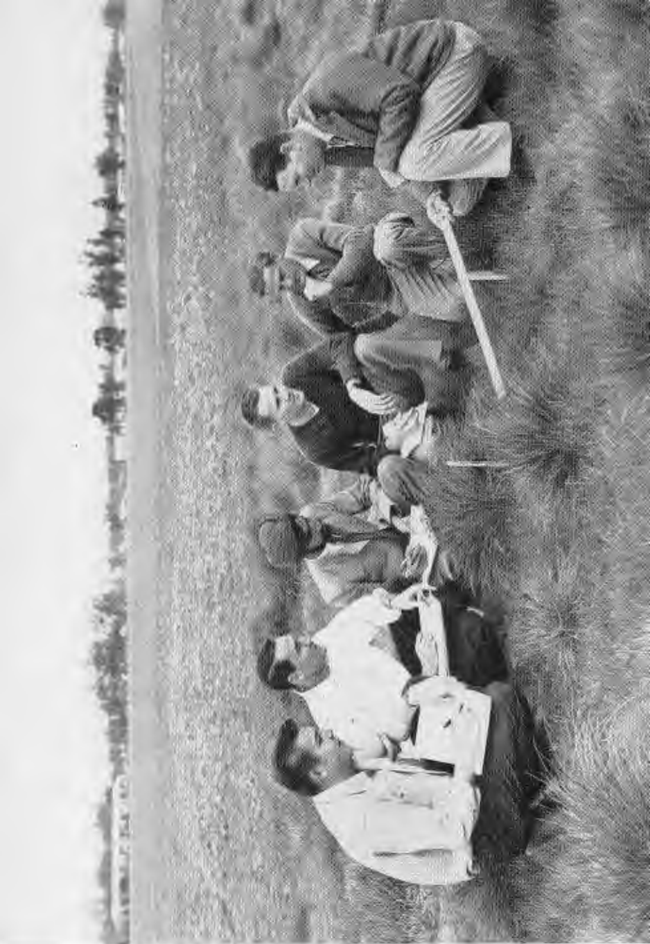
AN AGRONOMY FIELD LABORATORY EXERCISE