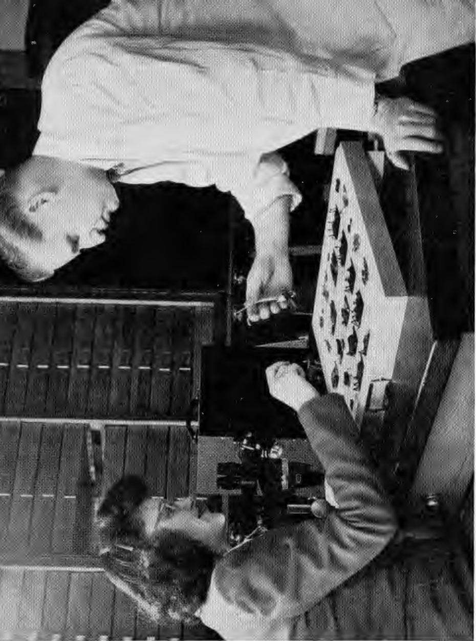
Students in entomology collect and classify insects of economic importance, Berkeley campus