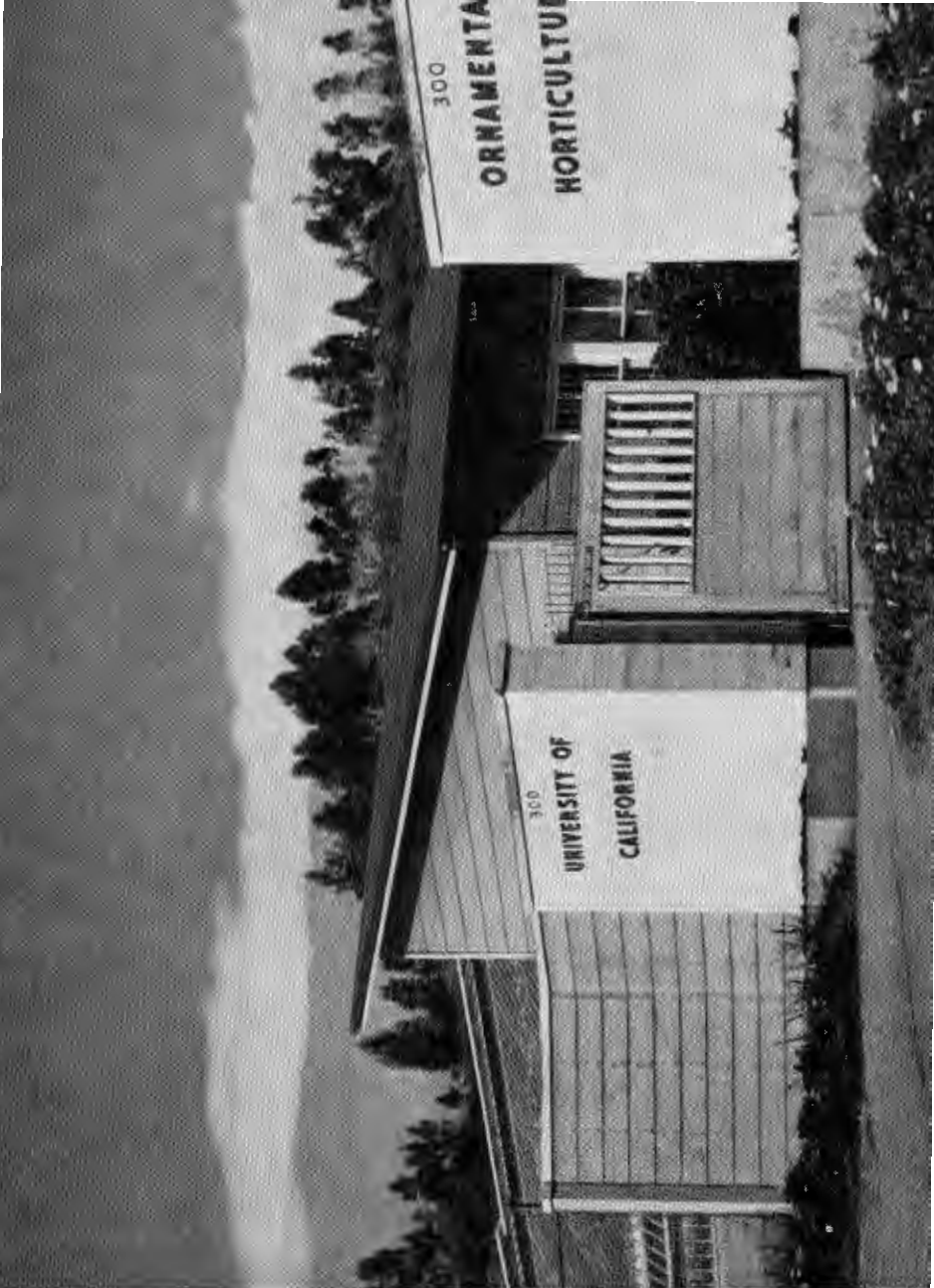
Students on the Los Angeles campus use special area devoted to the training of majors in ornamental horticulture