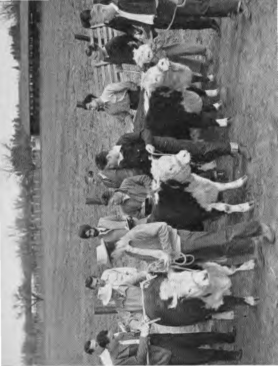
BEEF CATTLE PRODUCTION LABORATORY