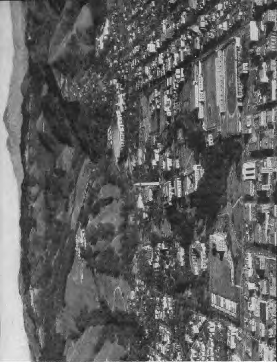
Air view of the Berkeley campus (1948)