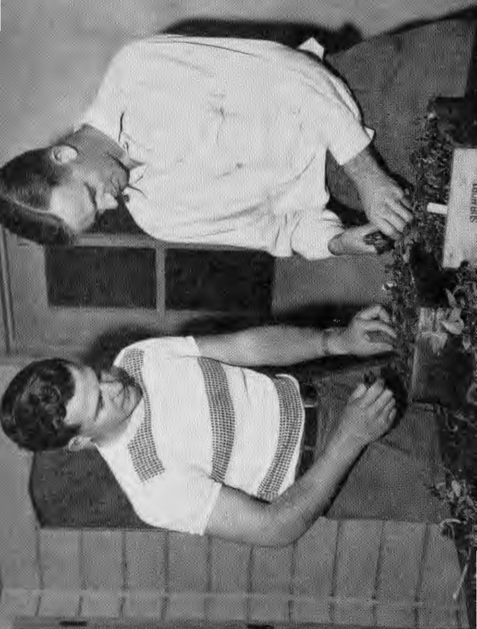
Students working with plant materials in propagation class, Los Angeles campus