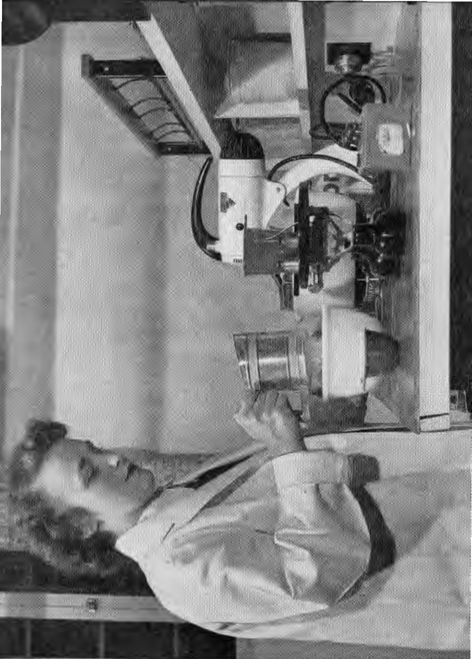
A student in home economics working on an experimental food program, Davis campus