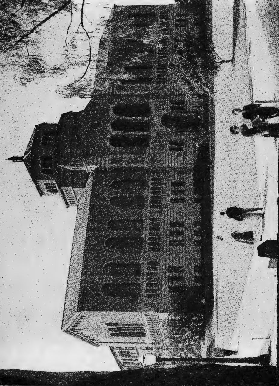
The Library—Los Angeles Campus