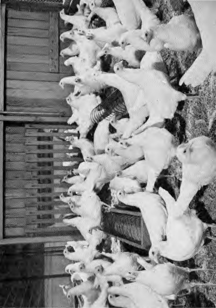
STUDENTS RAISE PULLETS IN A COURSE IN INCUBATION AND BROODING PRACTICE