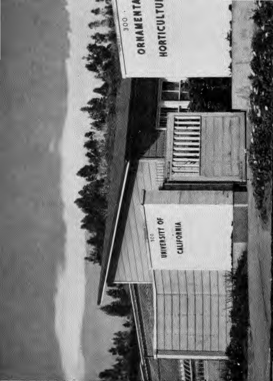
Students on the Los Angeles campus use special area devoted to the training of majors in ornamental horticulture