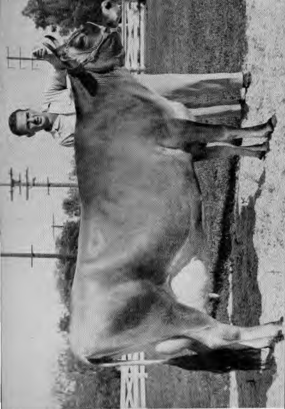
The University herds contain many fine animals