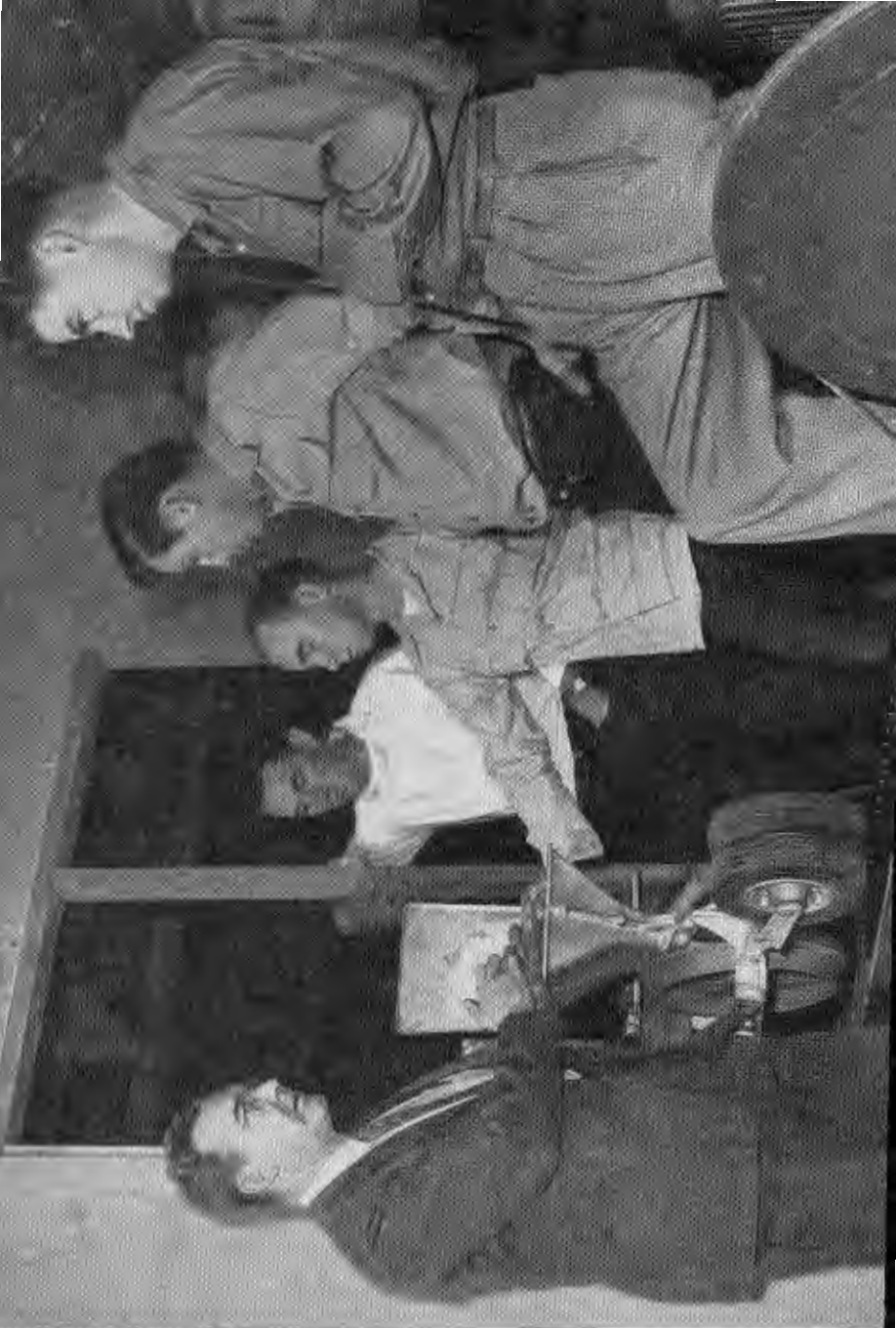
A seed-planting machine being demonstrated to a group of agricultural engineering students, Davis campus