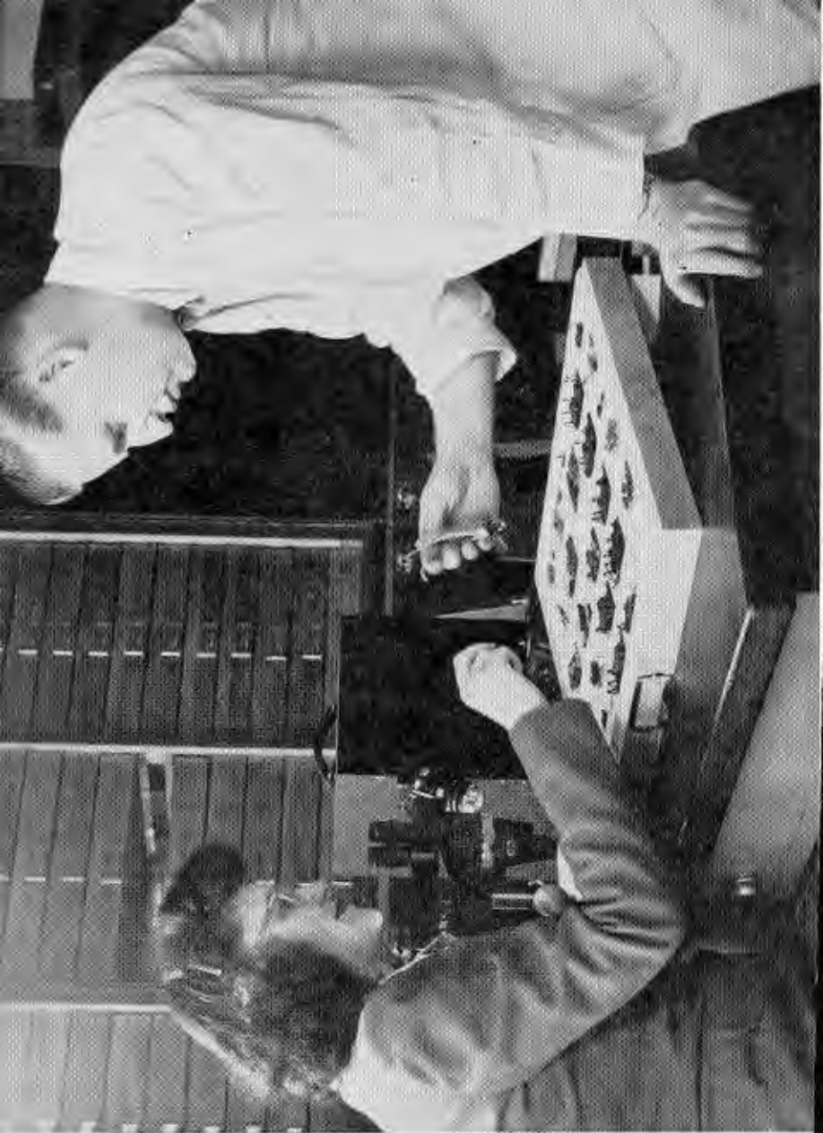
Students in entomology collect and classify insects of economic importance, Berkeley campus