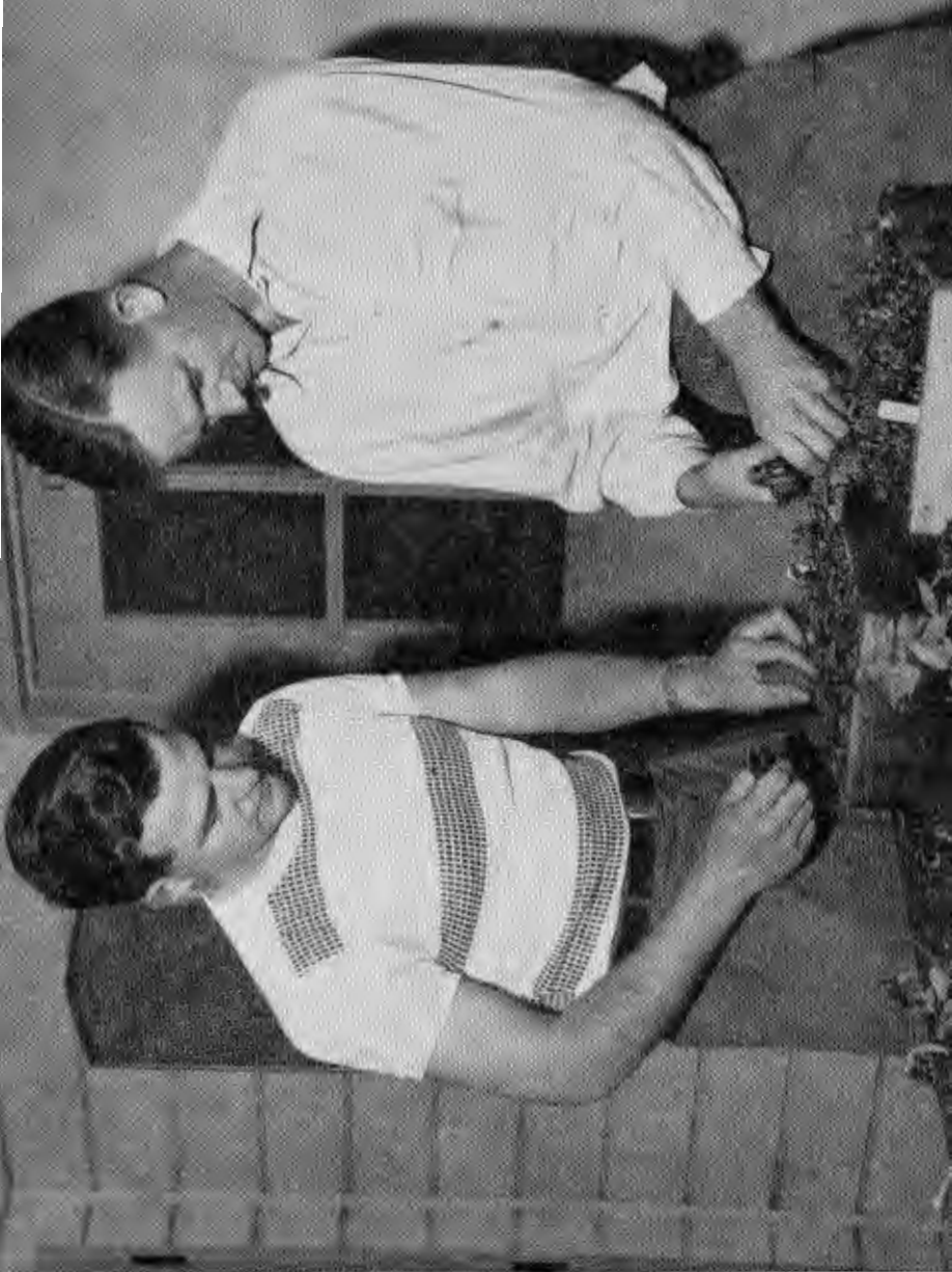
Students working with plant materials in propagation class, Los Angeles campus