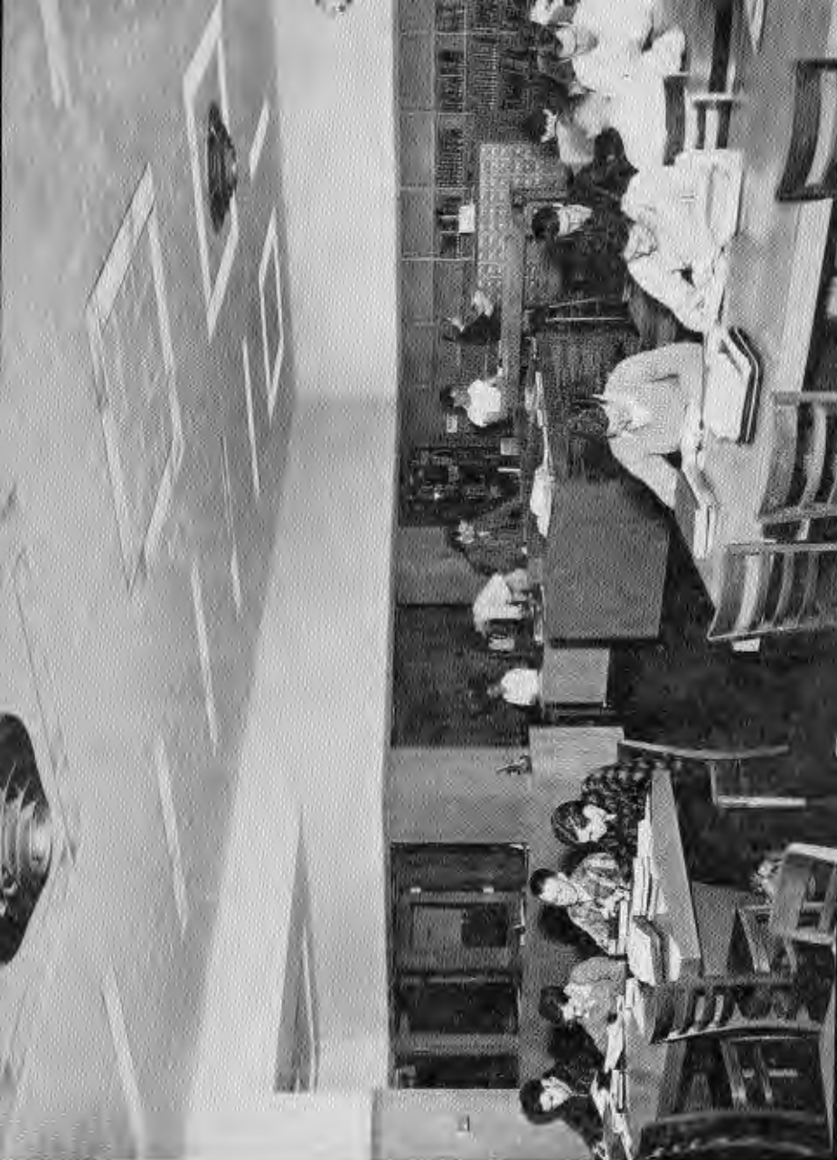
Section of the Forestry Library, Berkeley campus