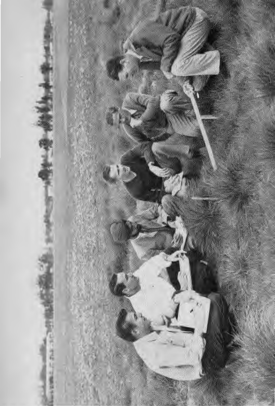
AN AGRONOMY FIELD LABORATORY EXERCISE