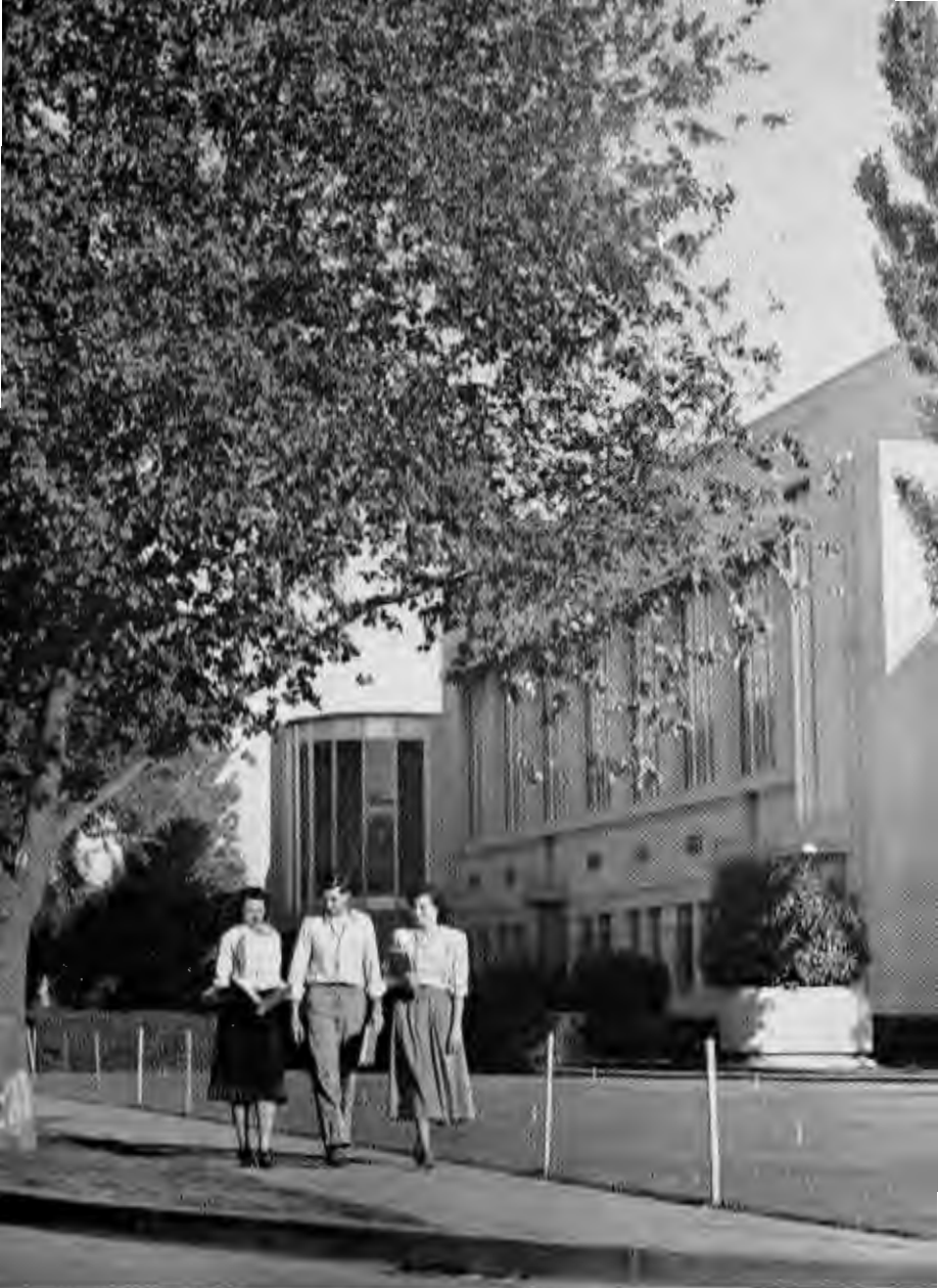
THE LIBRARY-ADMINISTRATION BUILDING ON THE DAVIS CAMPUS