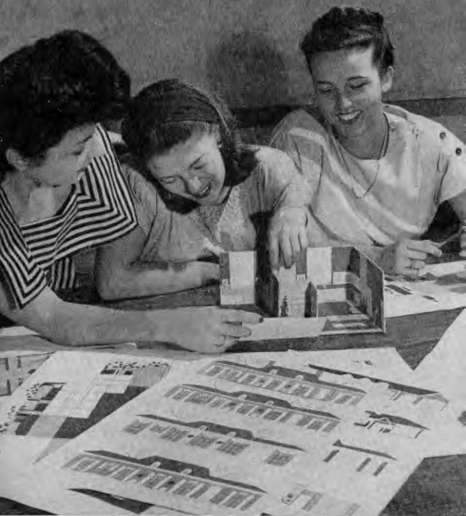
Creative talents flower in home decoration classes. Home economics is a good background for those who wish to become trained interior decorators