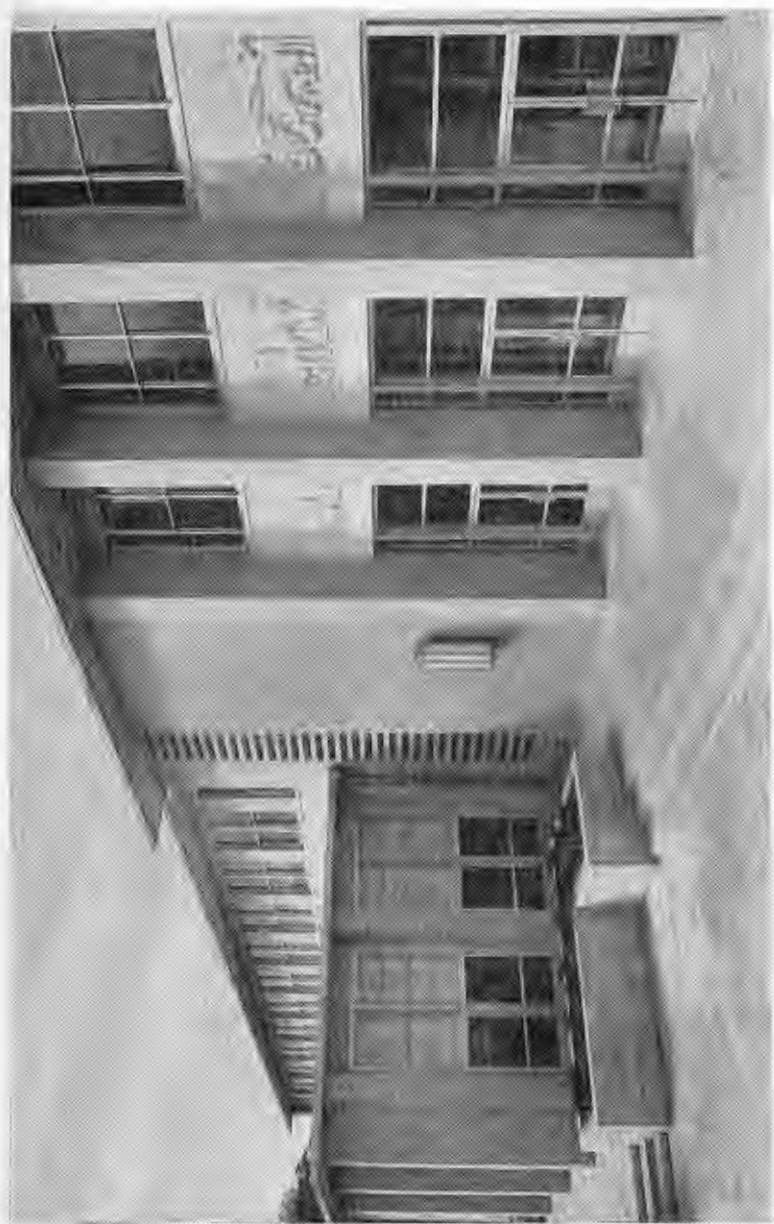
Main entrance to Veterinary Science Building, showing reading room on the left