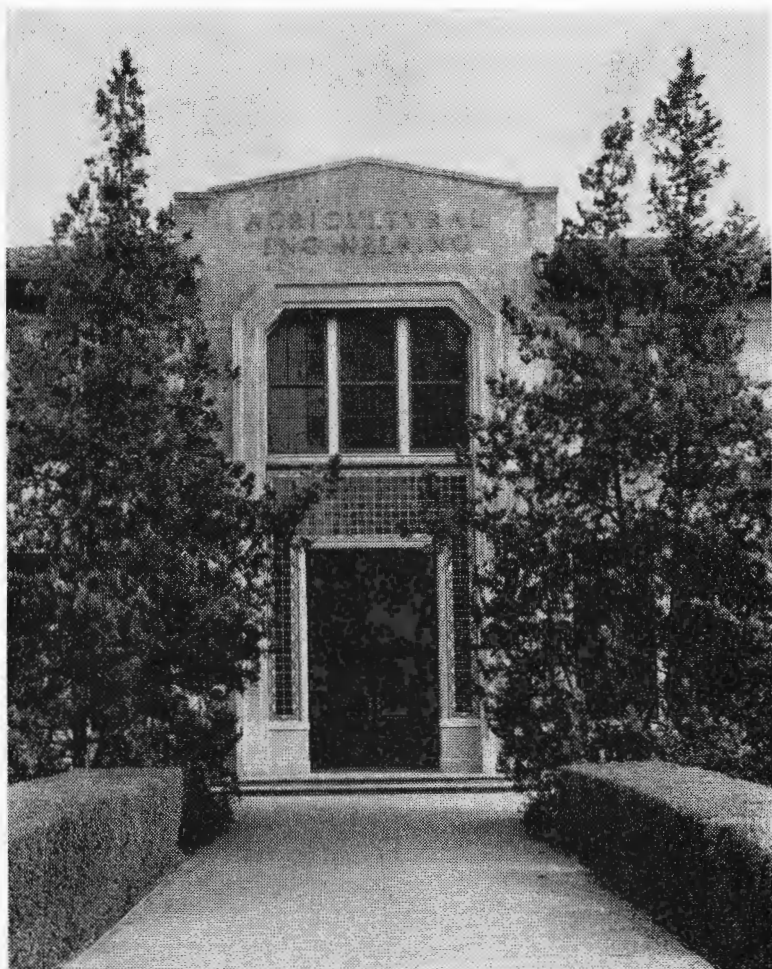
Main entrance of Agricultural Engineering Building