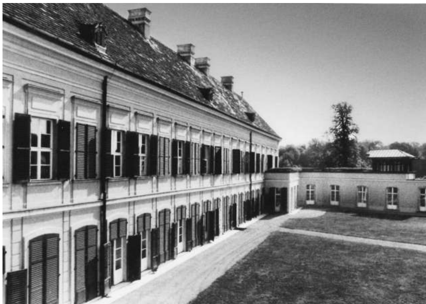
FIGURE 3. Schloss Laxenburg after reconstruction, 1978.

mathematician I interviewed joined IIASA in the early 1980s to find, in his words, a social milieu very similar to the one at home, the prestigious Steklov Mathematical Institute in Moscow. According to this scholar, the elite Soviet mathematical communities espoused rather democratic principles and informal relationships between professors and junior scientists, in this respect being completely different from other, more hierarchical scholarly environments, such as those of economists. 23 Some other scholars from East Europe voiced similar opinions: a Polish scholar even recalled that the atmosphere was much friendlier during the Cold War than it was at the time I interviewed him, because earlier directors made a particular effort to make sure that everyone felt welcome. 24 Also, some Soviet scientists came from elite academic institutes, which were, as David Holloway notes, rare islands of freedom in Soviet society. 25 These scholars told me that they did not encounter a big cultural difference; for them the key benefit of IIASA was the opportunity to freely access its increasingly rich library and, importantly, unlimited use of its photocopier. According to one member of administration staff, one could always be certain to find a visiting Soviet scholar at the copying machine. 26