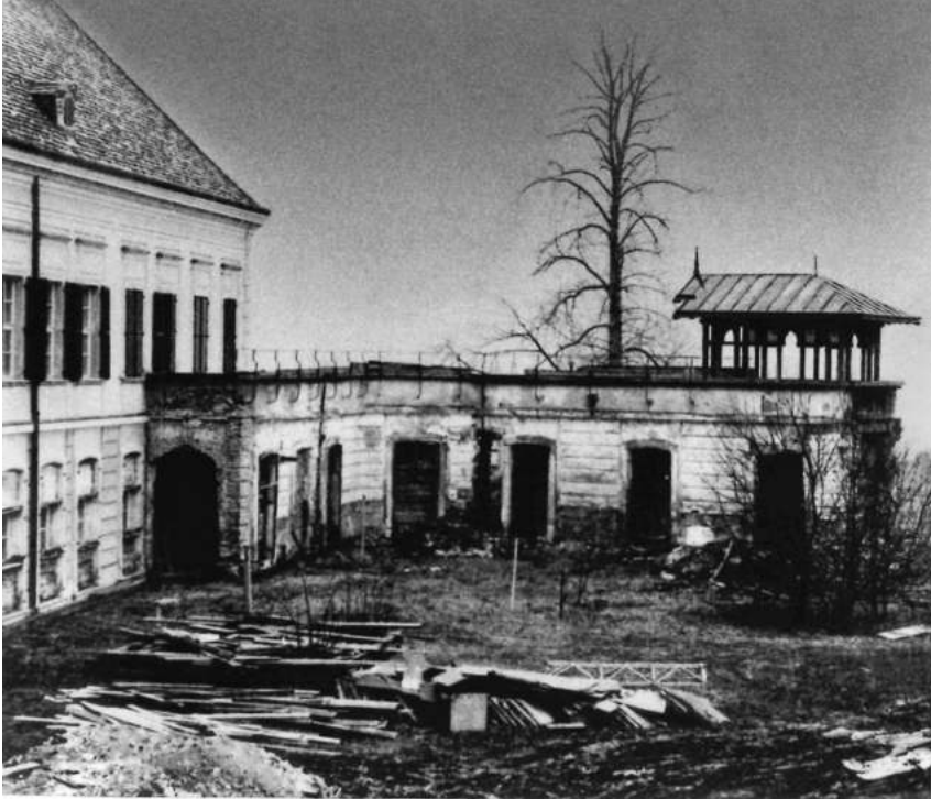
FIGURE 2. Schloss Laxenburg, 1962.

through the Women's Club, a network that was sustained by many women even after their partners left IIASA. Furthermore, the role of the fellows' wives was central in forging personal links across the Iron Curtain, as they were often the ones providing for the "real" home environment. For instance, Raiffa personally endeavored to bring the staff together, as he and his wife often hosted administrative staff for dinner in their apartment on Operngasse in Vienna. 22 It may well be that the metaphor of "IIASA family" remained viable after the 1970s, thanks to these carefully crafted practices, linking professional membership in the institute and personal lives.