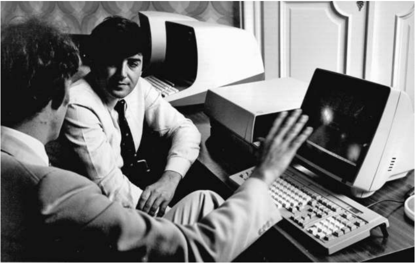
FIGURE 7. IIASA scientists at work, probably the 1970s.