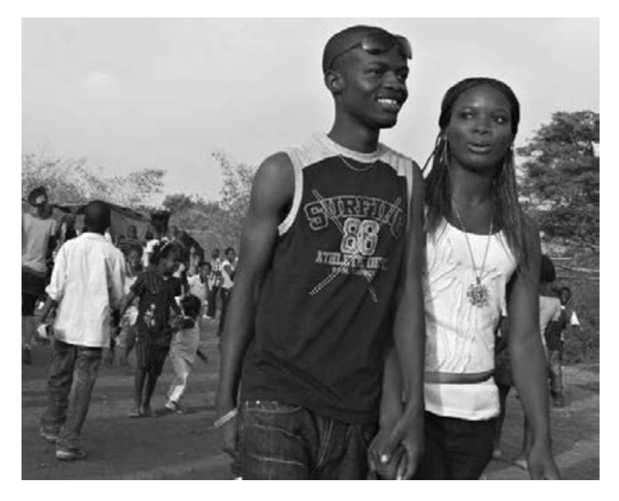
Figure 16 Looking to the future: young couple in Freetown, Sierra Leone, 2009