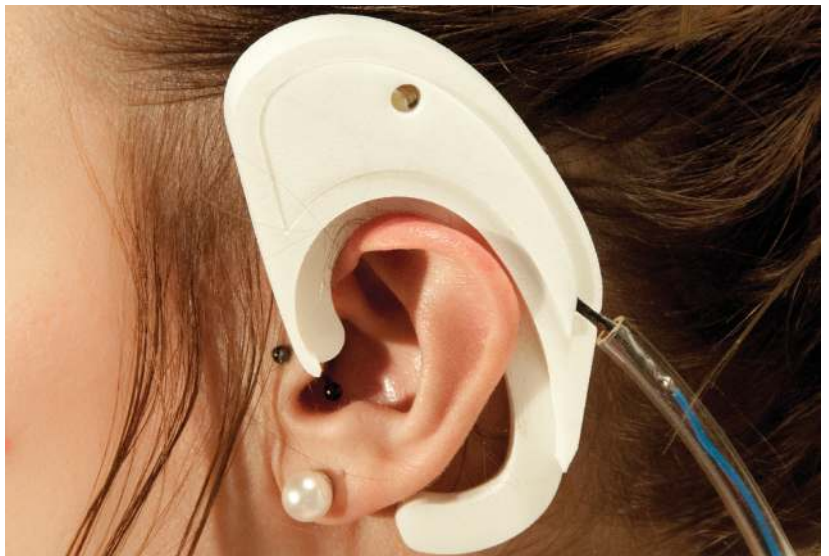
Ling Tan, Reality Mediators , 2013. Top: Mindwave device detecting brain wave activities. Middle Left: Microchip translating the biodata collected from the user's body. Middle Right: Muscle sensors detecting arm muscle activity. Bottom: Sound actuator fitted on back on ear.