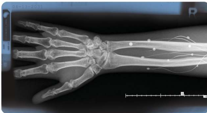
Ling Tan, SEED , 2013. Have you considered the intake of new sets of nutrients to grow SEED according to your desired outcomes?