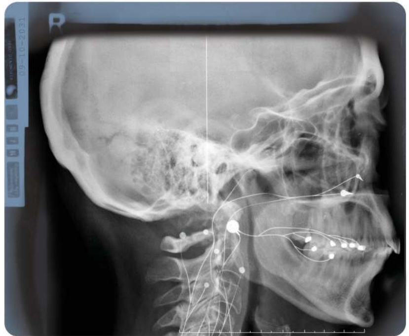
Ling Tan, SEED , 2013. Sign of healthy growth has been detected.

The SEED project surveys the possibility of bearable prostheses as commodities. It speculates on a future where embedded prostheses form a symbiotic relationship with the user’s body, taking on and modulating their genes through prolonged periods of growth and interaction.